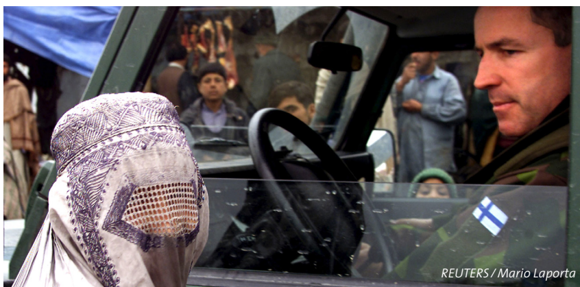
Encounter in Kabul: Finland's involvement in international crisis management includes operations in Afghanistan.

Since the end of the Cold War, Finland's security and defence policy has undergone significant changes. EU membership as well as convergence with NATO have supplemented Finland's traditional involvement in UN missions. They are the visible reflection of an intensified strategy of cooperation, which is also seen in Finland's participation in international crisis management. The country's self-perception continues to be shaped by the experience of history, its immediate proximity to Russia, and its geostrategic situation in the Northeast of Europe.