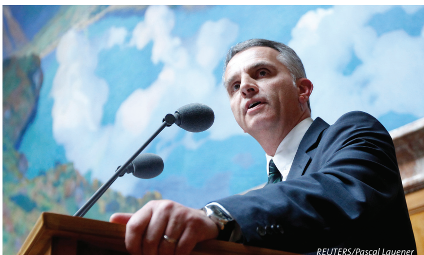
Newly elected foreign minister Didier Burkhalter speaks in the National Council, 19 December 2011.

Swiss foreign policy has become more dynamic in the past decade. However, the latitude for a distinct foreign-policy profile has diminished in recent years. The country's EU policy has reached an impasse. If it is to preserve major national interests in an environment marked by economic crisis and growing multipolarity, Switzerland will have to identify priorities more clearly, take a more strategic approach, and improve coherence in its foreign policy. Further efforts to consolidate domestic support for the country's peace policy are also needed.