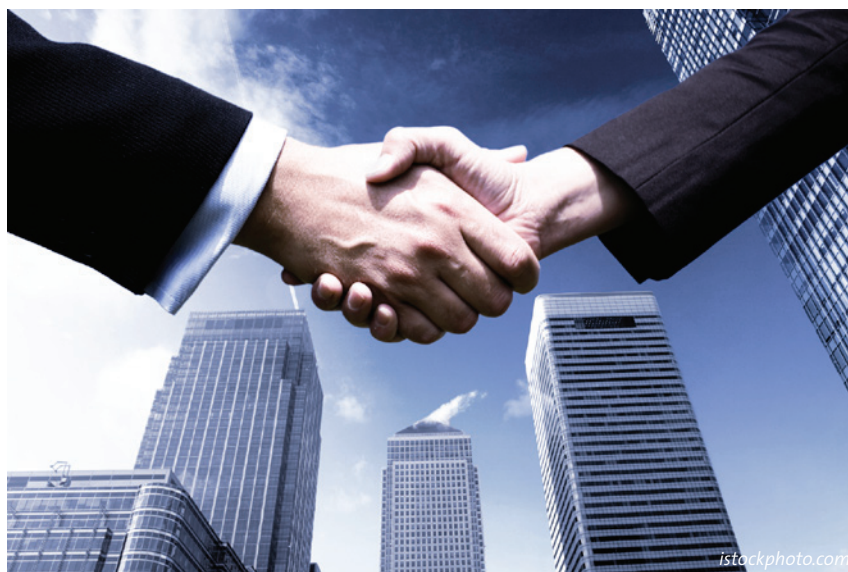
Cooperation between public and private actors is becoming increasingly important in security policy.

Cooperation between public and private actors has become an important instrument of domestic security policy. Public-Private Partnerships (PPPs) take on essential tasks in protecting critical infrastructures, in cybersecurity, and in ensuring security of supply. However, difficulties in implementing such partnerships in the areas of coordination, expectation management, transparency, and ensuring coherence should not be underestimated.