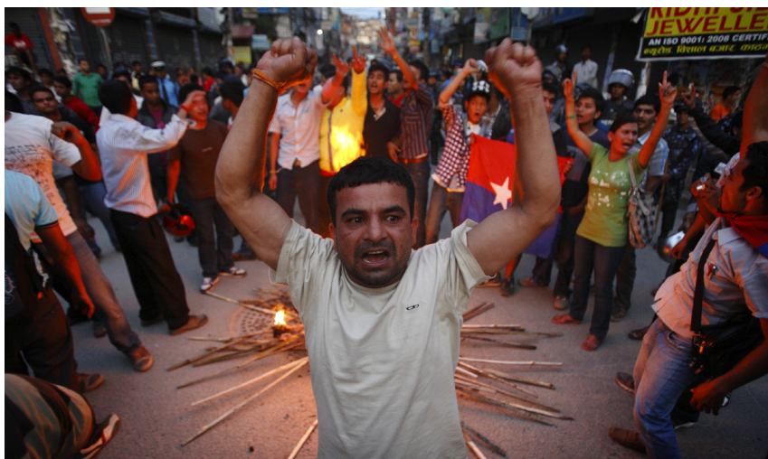
Deep political divides in Nepal: Demonstrators demand the resignation of Prime Minister Baburam Bhattarai. Kathmandu, 4 August 2012.

Nepal's civil war ended with a peace agreement in 2006. Following initial progress, the peace process has reached an impasse. Nepal's transformation into a democratic and federal state is being held up by political power struggles. The paralysis of the peace process is also overshadowing Switzerland's engagement for peace and development support in Nepal, which is regarded as a model due to its integrated approach.