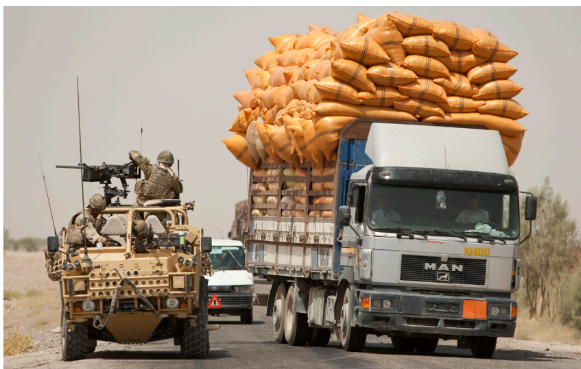
Cross-sectoral coordination of government activities is a great challenge: British troops in Helmand, Afghanistan, July 2011.

In the face of cross-sectoral challenges, the need for coordination in foreign policy has greatly increased. The “Whole of Government Approach” (WGA) facilitates enhanced cooperation between the administrative units of a state. It aims to enhance the effectiveness and coherence of government activities. Such coordination efforts, however, also require time and resources and occasionally supersede substantial implementation goals. Thus, a differentiated application of the WGA makes sense.