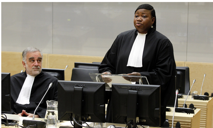
Passing on the baton at the ICC: Fatou Bensouda (Gambia) took over as chief prosecutor from Luis Moreno Ocampo (Argentina) on 15 June 2012.

After a decade of work, the International Criminal Court (ICC) has developed into an established institution of international criminal justice. Structural, legal, and political challenges remain, however: The gaps in membership are a problem, the focus on Africa has been criticised, and the relationship between justice and peace is a source of tension. Despite these difficulties, the ICC also has a preventive effect.