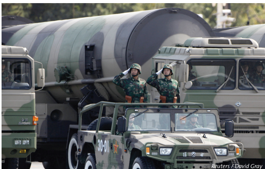
China is modernising its delivery systems: Ballistic missile at a military parade in Beijing, 1 October 2009.

China is gradually, but continuously building up its nuclear capabilities with the goal of continuing to maintain a credible nuclear second-strike capability vis-à-vis the US. At the same time, China regards its nuclear weapons as political currency. It is India, China's neighbour and also a nuclear power, that feels particularly threatened by Beijing's nuclear build-up. The outcome could be a nuclear destabilisation of the Asia-Pacific region.