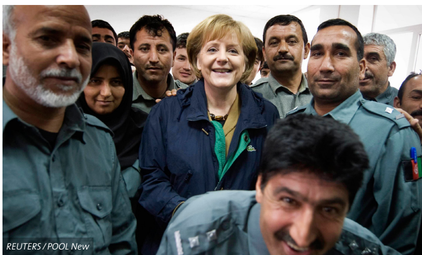
German Chancellor Angela Merkel with a group of Afghan police trainees, 06/04/2009

Civilian crisis management has become a central part of the EU's Common Security and Defence Policy (CSDP). The EU's ambitions in this field are reaching new heights, as is shown by the expanding geographical reach, the number of personnel deployed, and the operational complexity. But despite positive developments, challenges remain. In its current form, the EU runs the risk of jeopardising its own credibility as a civilian crisis manager. Capabilities, operational effectiveness, and strategic vision are all lagging behind.