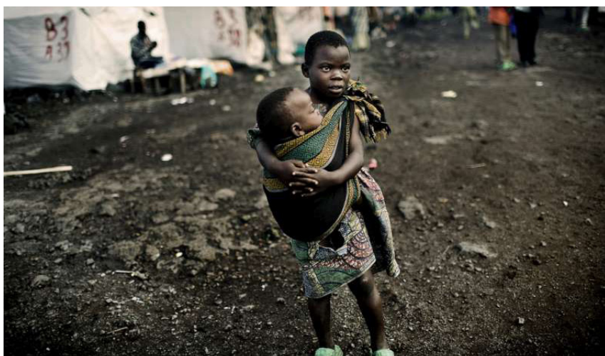
Human security concentrates on protecting the individual: Children in a refugee camp in Kibati, Democratic Republic of the Congo.

The concept of human security expanded the notion of security. The shift in focus from the state to the individual as the core object of security acknowledged the fact that intra-state conflicts such as civil wars, political violence, diseases, or poverty were greater threats to humans than inter-state wars. The concept has not brought about a paradigm shift in international security policy. But human security will most likely remain politically relevant even after recent changes in the strategic framework.