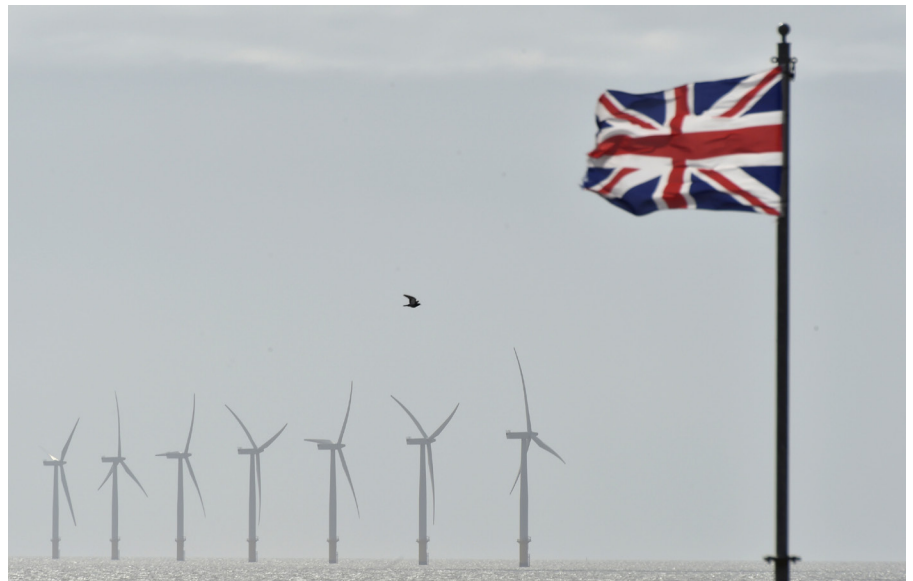
The UK has strongly advocated its own positions on energy and climate issues within the EU. Brexit will have a serious impact on this EU policy field.

It is nearly impossible to understand EU energy and climate policy today, in terms of its focal areas and steering instruments, without considering the influence that var-