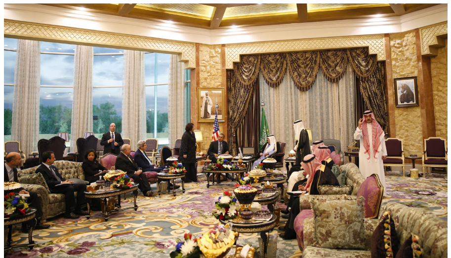
U.S. President Barack Obama meets with King Abdullah at Rawdat al-Khaim (Desert Camp) near Riyadh in Saudi Arabia, 28 March 2014.

Nevertheless, Saudi Arabia has been at odds with its Western partners of late. In an article published in the International New York Times in late 2013, Saudi Ambassador to Britain Mohammed bin Nawaf bin Abdulaziz al-Saud declared that Saudi Arabia's relationship with its Western partners, particularly that with the US, had been tested due to differences over the handling of the Iranian nuclear program and the civil war in Syria, leading Riyadh to conclude that it had no option but to play a more assertive role internationally. This uncharacteristically public expression of displeasure followed its rejection of a tempo-