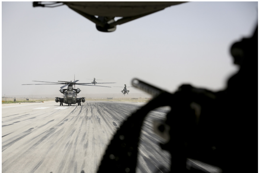
A CH-53 helicopter of the Bundeswehr with Chancellor Angela Merkel on board arrives in Mazar-e Sharif, Afghanistan, escorted by two helicopter gunships «Tiger», 10 May 2013.

As a confounding factor, the parameters of multinational integration within the alliances will change fundamentally: The return of "symmetric" threats, reinforced by the Ukraine crisis, will expose inherent problems with the integrated cooperation models that have been attempted since 2000. In the near future, operations within the framework of Nato and the EU will likely be conducted on a principle that might be described as "ad-hoc plus": the spontaneous configuration of task forces,