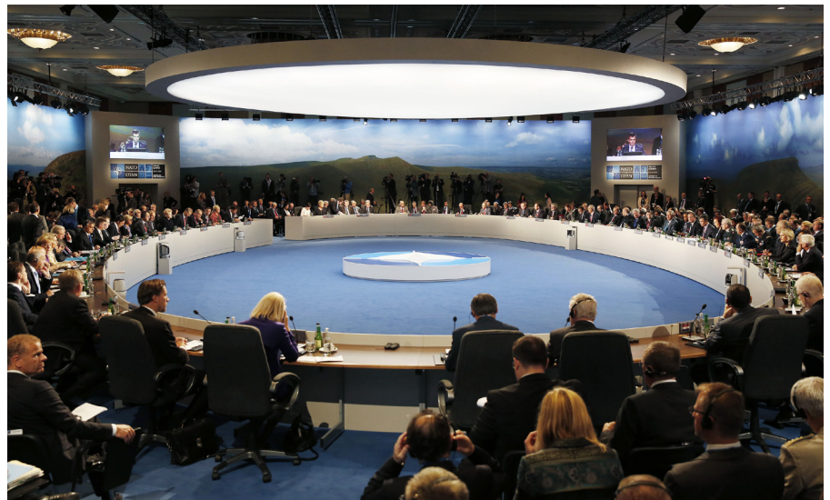
NATO leaders discuss the Western reaction to the Russian aggression in Ukraine in Newport, Wales.

The Wales summit has resulted in compromises that signal coherence in alliance policy without constituting a decisive difference under any relevant scenarios. This might change in the future: The NATO decisions leave room for additional measures if the strategic picture in Europe