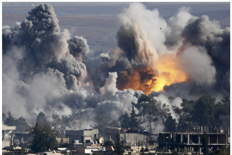
After US airstrikes, smoke rises over the Syrian town of Kobani in the Turkish-Syrian border region (18 October 2014).

The US now faces the huge challenge of embedding the use of military force into a stable overall political concept. Notwithstanding frequent criticism, the US approach so far is coherent. Only those who are willing to accept a radical paradigm shift in the region could conceive a fundamentally different strategy – a prospect that even most US critics of the current course abhor, and with good reason. In a highly complex environment, Obama is attempting to preserve core US interests without obstructing the evolutionary development of the Middle East or allowing himself to become ensnared in an unwanted war. However, the operations against the IS are notable for the fact that in Iraq at least, there is a political end-state that would be acceptable for most parties, at least in the short term. For Syria, no such state exists. Therefore, the strategic expediency of military force must be analyzed separately for each country.