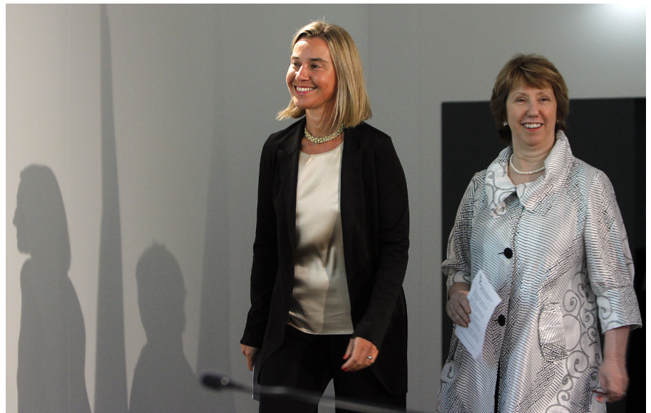
On 30 August 2014, Catherine Ashton (on the right) and her freshly selected successor Federica Mogherini arrive for a news conference at the end of a meeting of EU Ministers in Milan.

In 2010, Ashton spent much time and energy on building up the new European External Action Service (EEAS). Moreover, in the aftermath of the financial crisis, the need for a common EU foreign policy was regarded as a negligible issue. In 2015, the