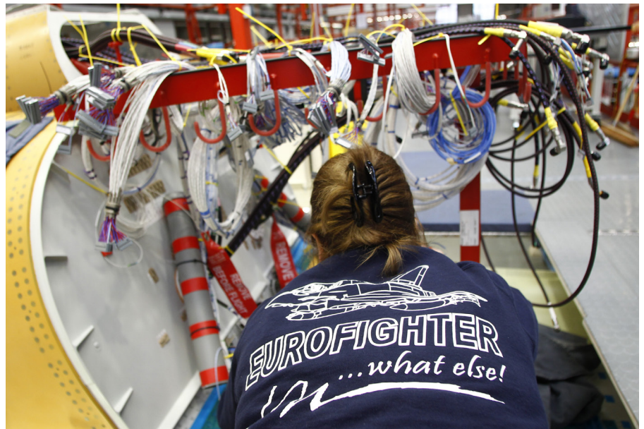
Experiences with past or ongoing major projects like the Eurofighter “Typhoon” shape the future defense procurement in Europe.

Nevertheless, the European states have been feeding off their comparative advantages in economic innovation and their greater bureaucratic flexibility, which allowed even small states like non-aligned Sweden to produce state-of-the-art weapons systems such as the multirole JAS 39 “Gripen” fighter jet until well into the 1990s. Nonetheless, in Europe, too, the ability of national defense industries to