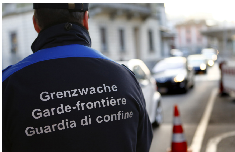
If the border guard corps reaches its limits, it will receive support from the police in the first instance. The tasks the police forces were to take on would be determined by their level of training.

Should the SBG require support, the Federal Department of Finance (FDF), of which the SBG is a part, would request police reinforcements – initially from the canton in which assistance is required. Should this measure prove insufficient, the FDF and the Federal Department of Defence, Civil Protection and Sport (DDPS) would submit an application to the Federal Council for support by military forces. The Federal Council would then decide on the deployment of soldiers and assign troops to the SBG. Initially, it is anticipated, the