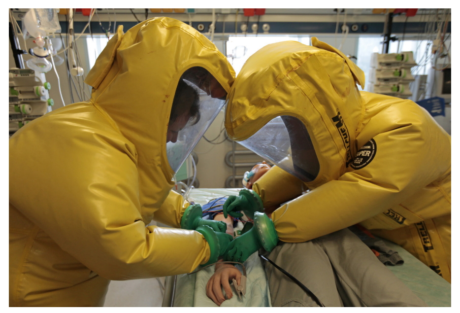
Scientific-technical advances bring about new challenges. Therefore, the Biological Weapons Convention is to keep pace with possible threats.