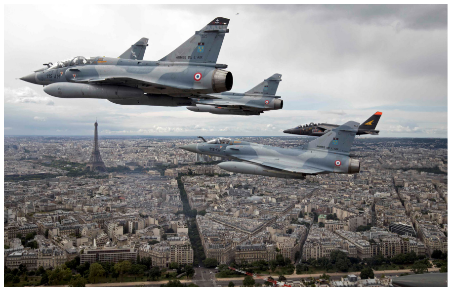
Four Mirage 2000 and an Alpha-Jet flying over Paris on July 14th 2016.

This analysis is not an assessment of the electoral programs produced by the French presidential candidates (the first round of elections will be held on 23 April 2017). Instead it considers the geostrategic and