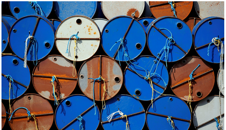
The global oil market is characterised by an oversupply since the beginning of 2015.

Developments in the global oil market over the past decades can be broken down into three phases. Starting from a phase of relative stability pre-2004, when prices usually peaked at below USD 30 p.b., 2005 saw the start of a phase of high price volatility, which was seen as caused by the growth of