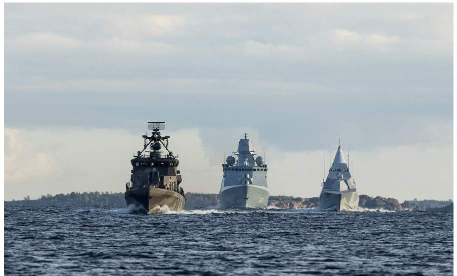
Finnish vessel Rauma, Denmark's HDMS Niels Juel and Sweden's HMS Helsingborg head to Turku during the Northern Coasts 2014 international naval exercise.

Disproportional cost increases and inefficient procurement processes, which are seen as causative elements of the structural crisis in arms procurement by some, are important aggravating factors in this regard. However, if we adopt a longer-term perspective, it becomes clear that the current urgent need for modernization is chiefly due to a set of flawed assumptions about the future development of European security that have largely proven unsustainable. At the same time, the effects of advancing material fatigue are making themselves felt with increasingly force. After the end of the Cold War confrontation, given the perception that the plausibility of conventional conflict scenarios had diminished, it seemed justified to put major armaments investments on the back burner. Political deferments, structural adaptations of the armed forces, and upgrading of comparatively “young” main weapon systems allowed the planners to temporarily pre-