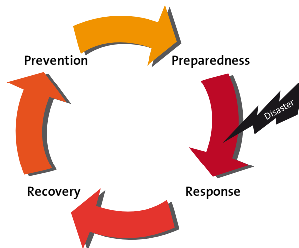
Fig. 1: The disaster cycle – prevention, preparedness, response, and recovery.

managing disasters. The full disaster cycle – prevention, preparedness, response, and recovery – should be taken into consideration for any type of disaster, be it natural or man-made: 14