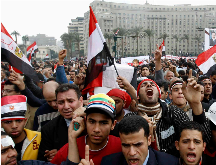
Anti-government demonstrators at Tahrir Square in Cairo, 7 February 2011

Recent turmoil in the Middle East has prompted calls for a better understanding of the driving forces in the region. The divisions between fledging new republics and old authoritarian regimes might develop into the new defining feature of the region. The wave of protests will also reinforce ongoing strategic trends such as the rise in importance of the non-Arab periphery and the weakening of the regional heartland. In the long-term, the Persian Gulf region can be expected to reorient itself towards East and South Asia.