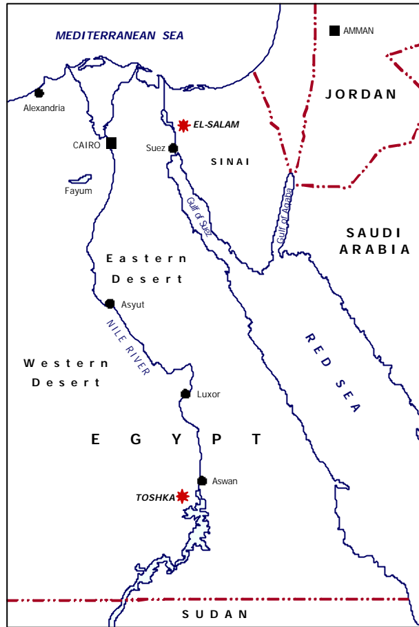
Figure 2. Locations of Mega projects in Egypt (Hamza 2003)

It has been mentioned in a specialized study that “under the pressing overpopulation problem entailing a progressive dependence upon imported food from abroad, Egypt has to continue a sustained horizontal expansion in the agricultural field exploiting to the maximum all the available water resources in order to satisfy all the food needs of the people, or at least minimize Egypt’s foreign dependence in this respect (SIS 1999). Nevertheless, Egypt imports about 40% of its basic food requirements – due to economic considerations (Mason 2004).