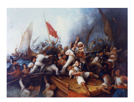
C Stephen Decatur boarding a Tripolitan gunboat during a naval engagement, Aug. 3, 1804

Now the "Barbary" coast of North Africa, Suez Canal, Red Sea and Gulf of Aden are once again facing a return of maritime terrorism with the presence of Islamist groups including ISIS and al-Qaeda. With so much focus on freedom of navigation in the South China Sea and France pushing EU for joint patrols, one wonders if France should look closer to the Mediterranean for patrols, and move forward with the EU parliament's proposed arms embargo on Saudi Arabia that is supporting jihadi groups to destabilize the EU's southern neighborhood. Value 141