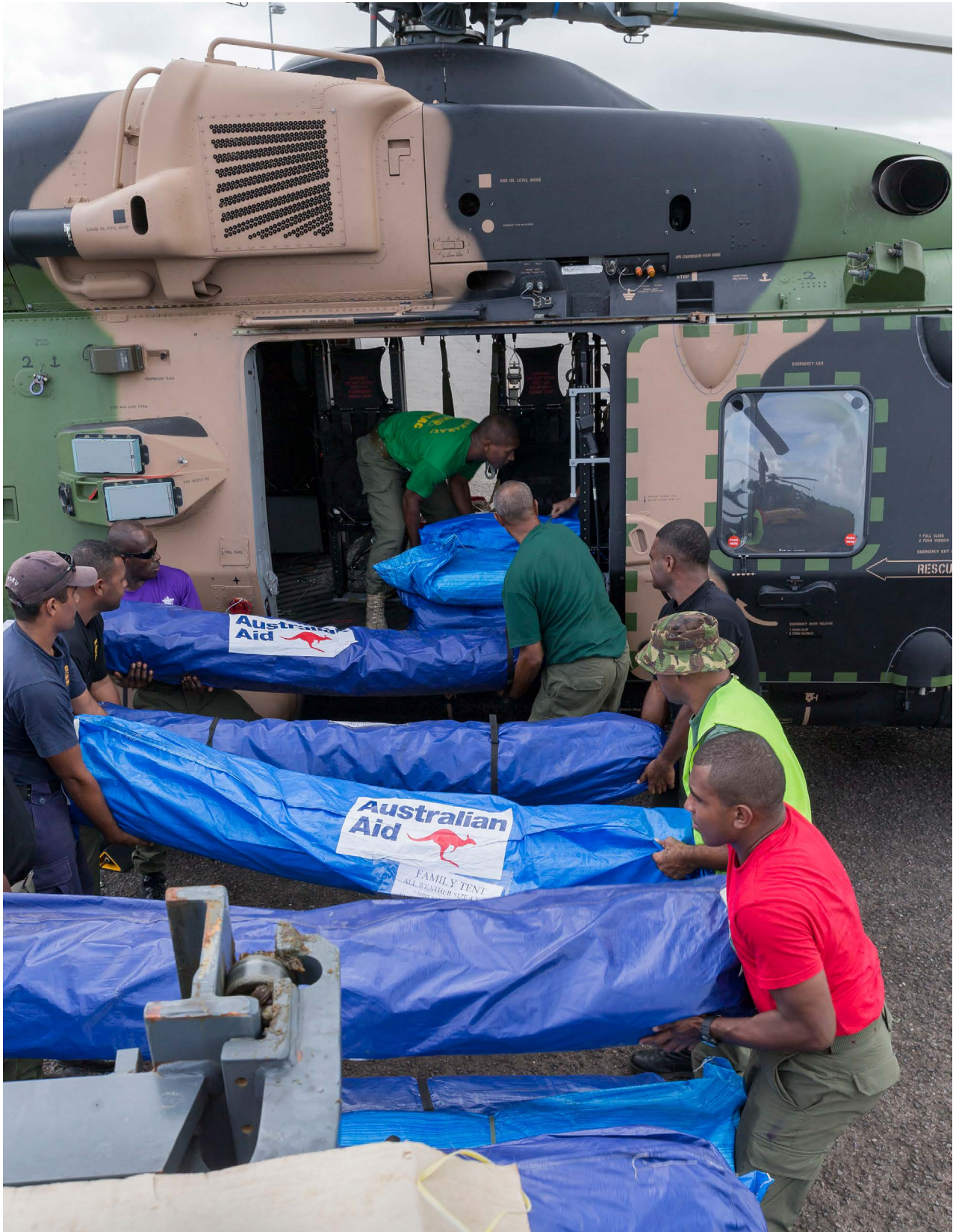
Republic of Fiji Military Forces personnel and Fiji Police Force officers load family sized tents from Australian Aid into an Australian Army Taipan MRH-90 helicopter at Suva Airport, in support of Operation Fiji Assist, 2 April 2016.