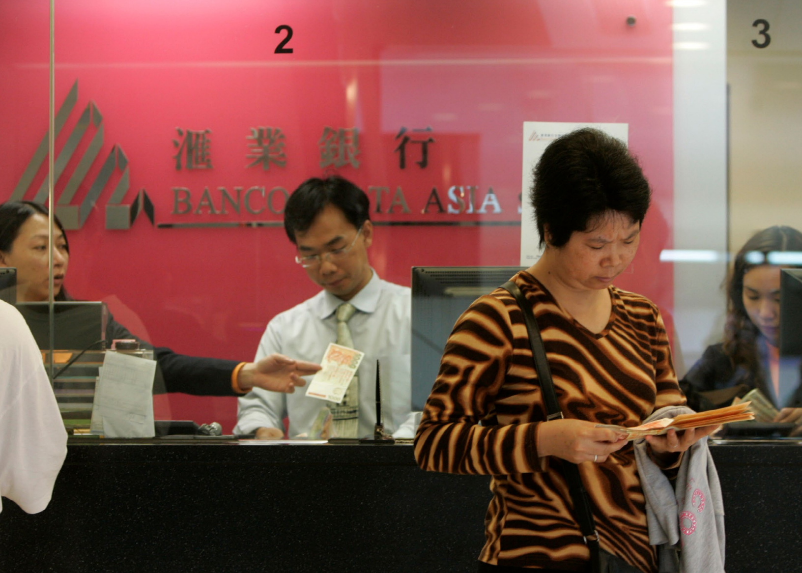
A woman holds bank notes at Banco Delta Asia in Macau, China.

records regarding the account, even those located outside of the United States, including the identity of each beneficial owner of the foreign bank, unless the bank is publicly traded. 266