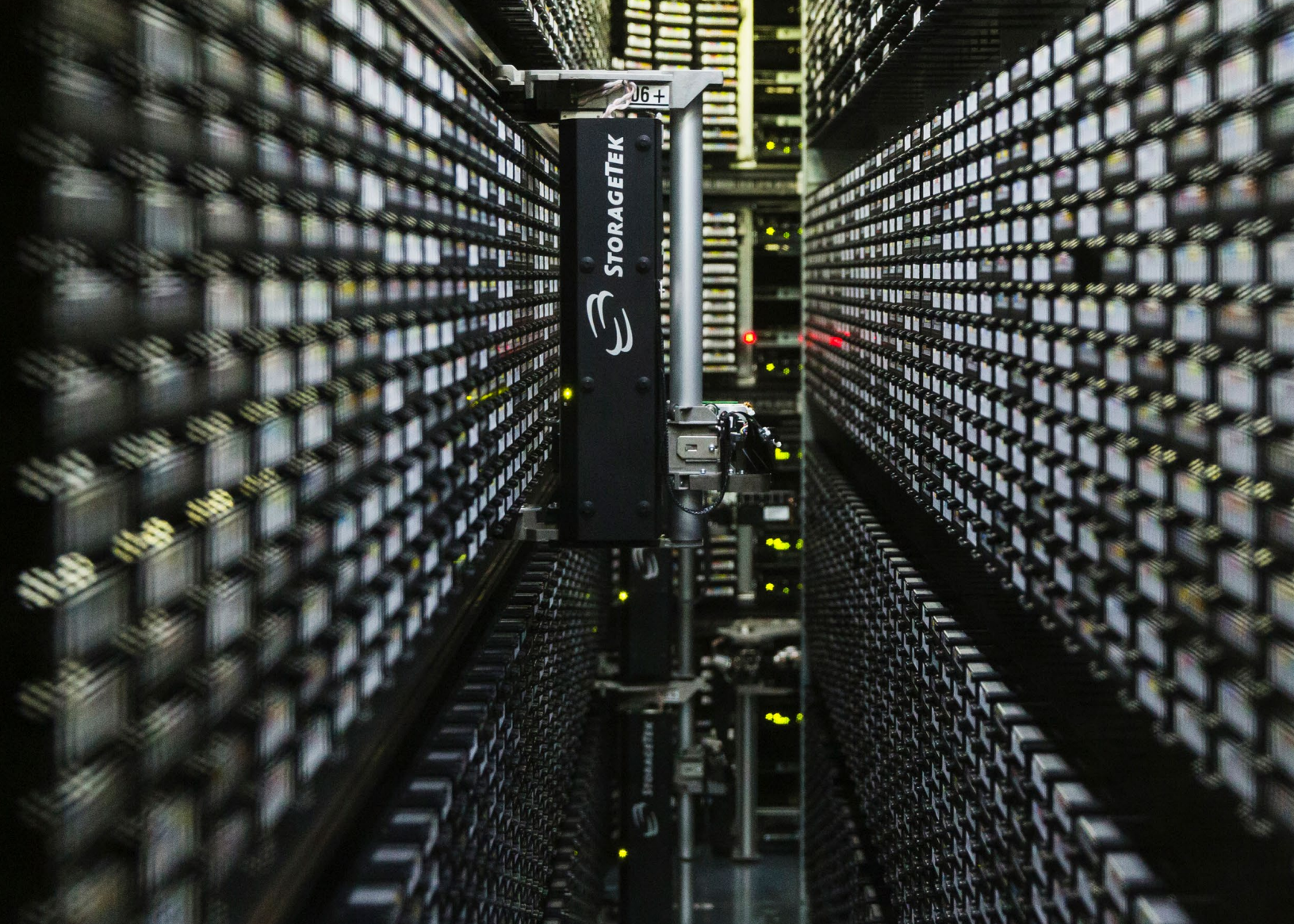
A robotic tape library used for mass storage of digital data is pictured at the Konrad-Zuse Centre for applied mathematics and computer science (ZIB), in Berlin.

with the 2003 EU-US mutual legal assistance agreement, 60 the 2002 Europol-US Agreement, 61 and the 2006 Eurojust-US Agreement, 62 were complemented with the 2016 agreement between the United States and the EU on the protection of personal information relating to the prevention, investigation, detection, and prosecution of criminal offenses. 63 This “Umbrella Agreement” offers a “superstructure” to the prior agreements, consisting of a set of safeguards protecting data exchanged under the terms of the agreements. Most importantly, the European Commission made the signing of the Umbrella Agreement dependent on the adoption of the US Judicial Redress Act. 64 The latter expands the scope of the 1974 Privacy Act