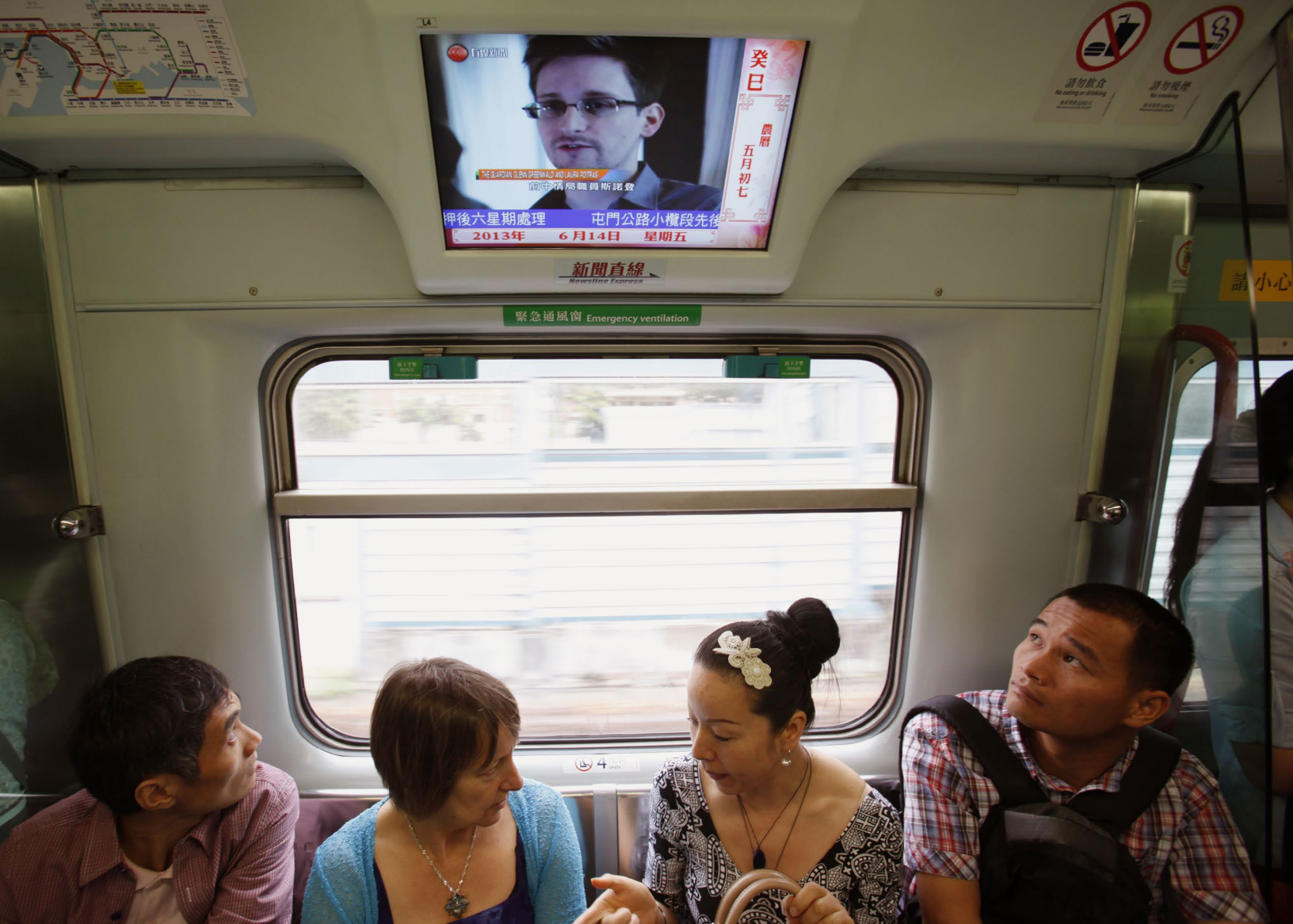
Passengers watch a television screen broadcasting news on Edward Snowden, a contractor at the National Security Agency (NSA), on a train in Hong Kong June 14, 2013.

from the wealth of information that is produced by modern computing systems, both at the individual and network level. Additionally, most security experts agree that a comprehensive approach that integrates best practices across policy, technology, and people while building secure, transparent relationships is a necessary and effective security strategy.