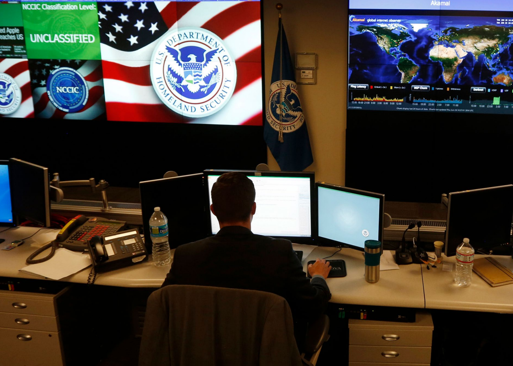
US Department of Homeland Security employees work in front of US threat level displays inside the National Cybersecurity and Communications Integration Center.

of human-machine trust has risen to prominence in recent years 102 and will continue to increase as automation becomes more ubiquitous, requires less human involvement, and is increasingly relied upon throughout society.