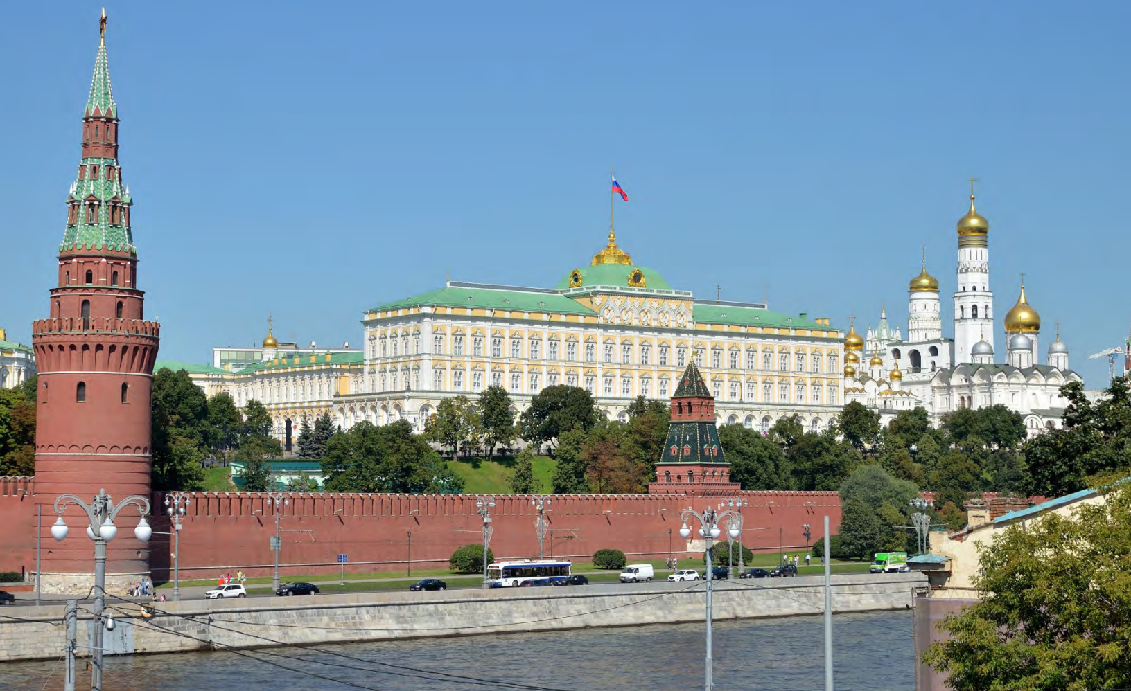
The Kremlin, seat of the Russian government in Moscow.

motivation, by aligning themselves with the Kremlin, these groups and individuals undermine European interests, unity, and long-term security.