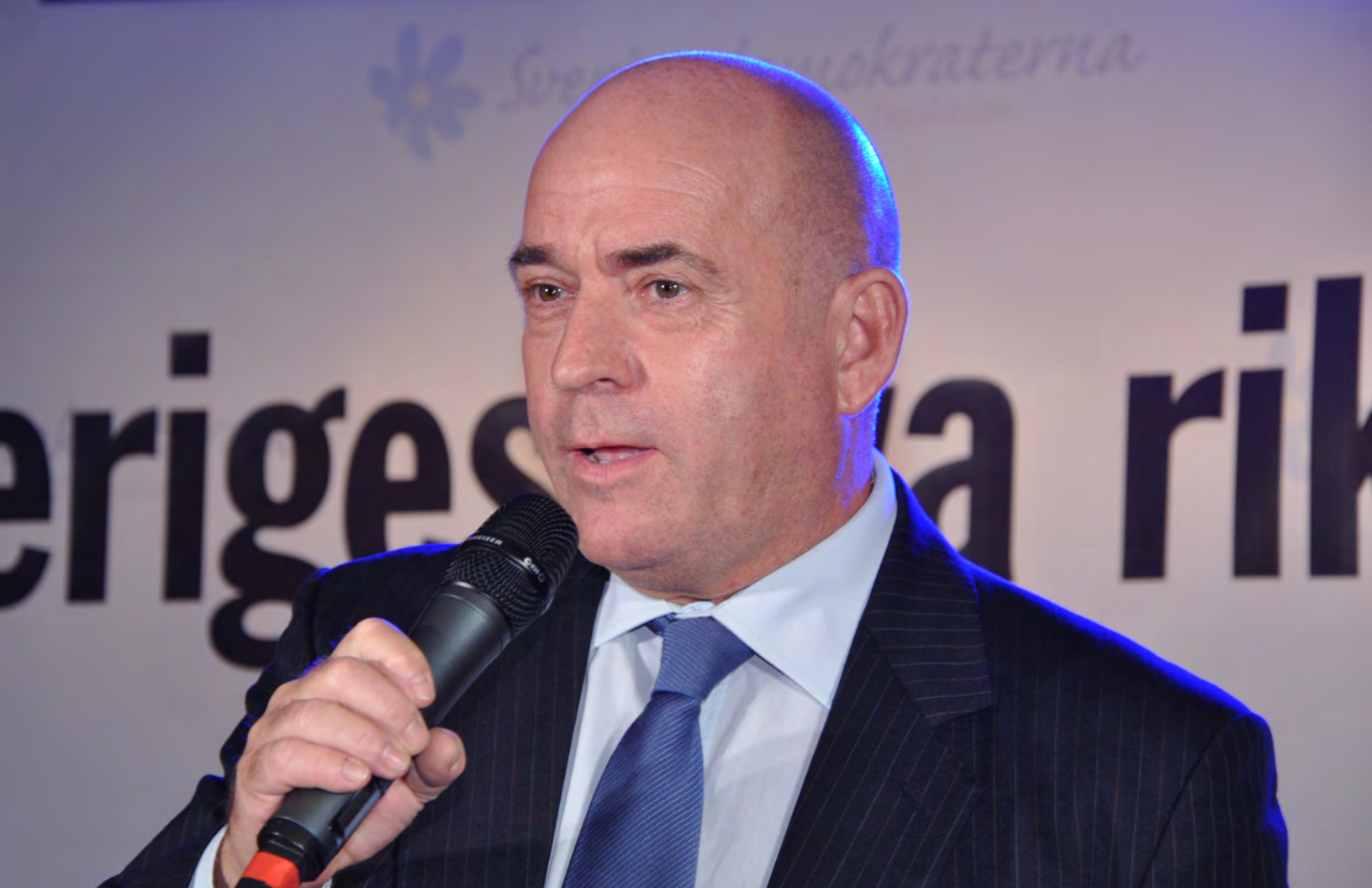
DPP foreign policy spokesperson Søren Espersen, seen as something of a Russia hawk within the party.

is an undergrowth of strongly pro-Kremlin voices on social media—some also offering their services to well-established media, albeit usually in vain—and even quasi-trolling is now prevalent. 7 Still, both the number of quasi-trolls and their organizational strength appear low when compared with other states in Northern Europe. 8