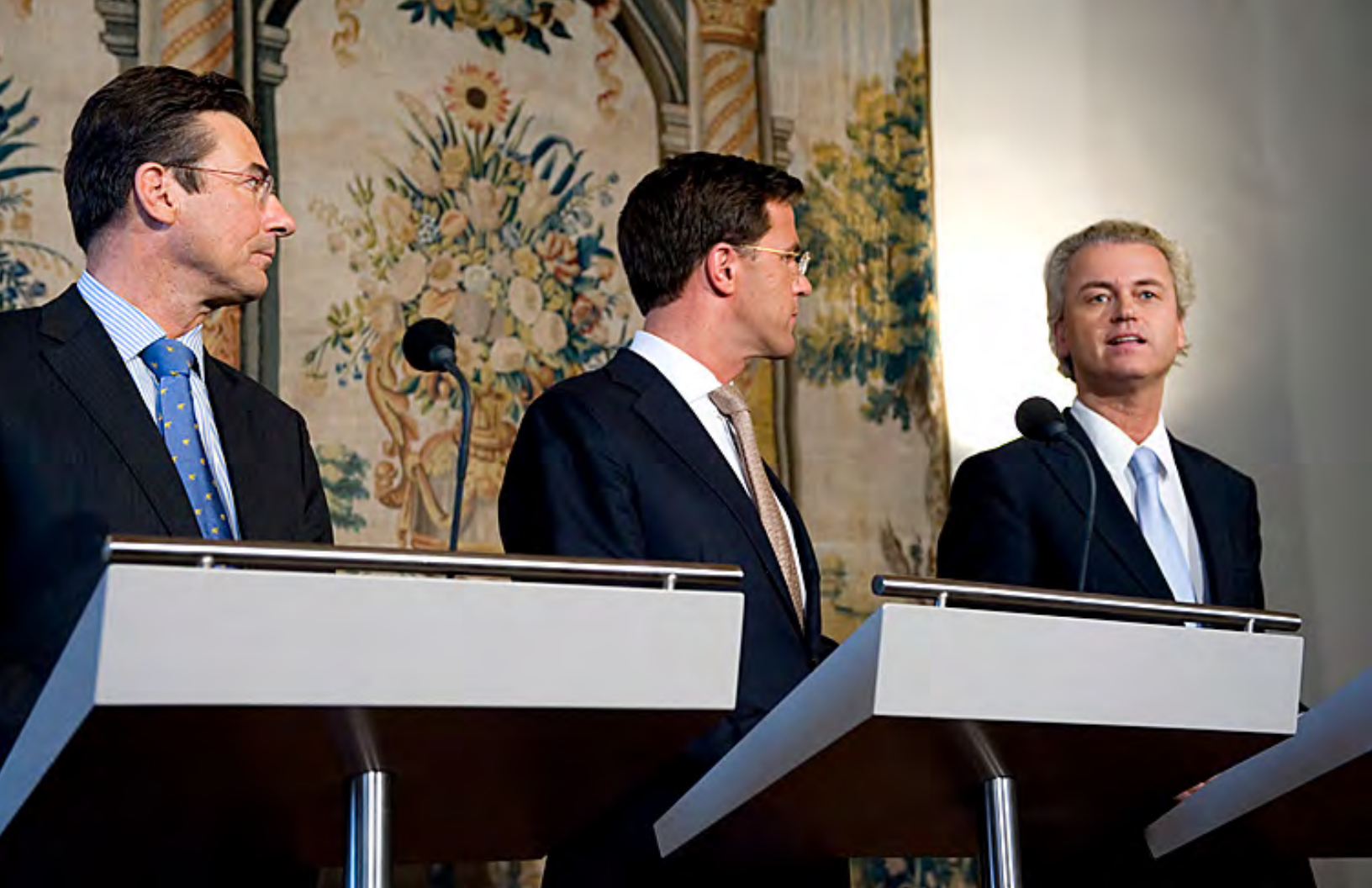
Geert Wilders (right), leader of the nationalistic PVV, holds a reputation of pro-Russian sentiment and was one of the few Dutch politicians not to assign blame following the MH17 incident.

enemy, according to Wilders, but rather an ally in the battle against terrorism, Islam, and mass immigration from Africa. 45