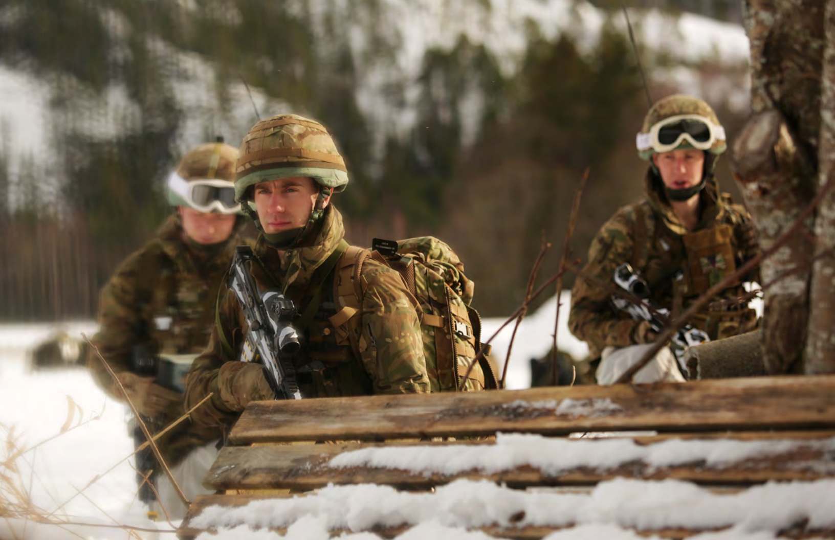
NATO forces taking part in Operation Cold Response, annual winter warfare exercises in central Norway.

appeared on social media, echoing nationalistic cries during the annexation of Crimea. 82 Moscow created a “stop list” of Norwegians barred from entering Russia (among them the journalist who broke the Rogozin story). 83 In retrospect, the whole affair smacks of a coordinated campaign combining public diplomacy, social media, and boots on the ground to undermine Norwegian perceptions of Svalbard’s status.