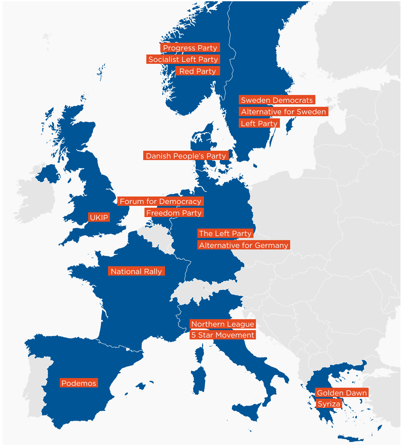
Map 1. Pro-Russian Political Parties in Western Europe