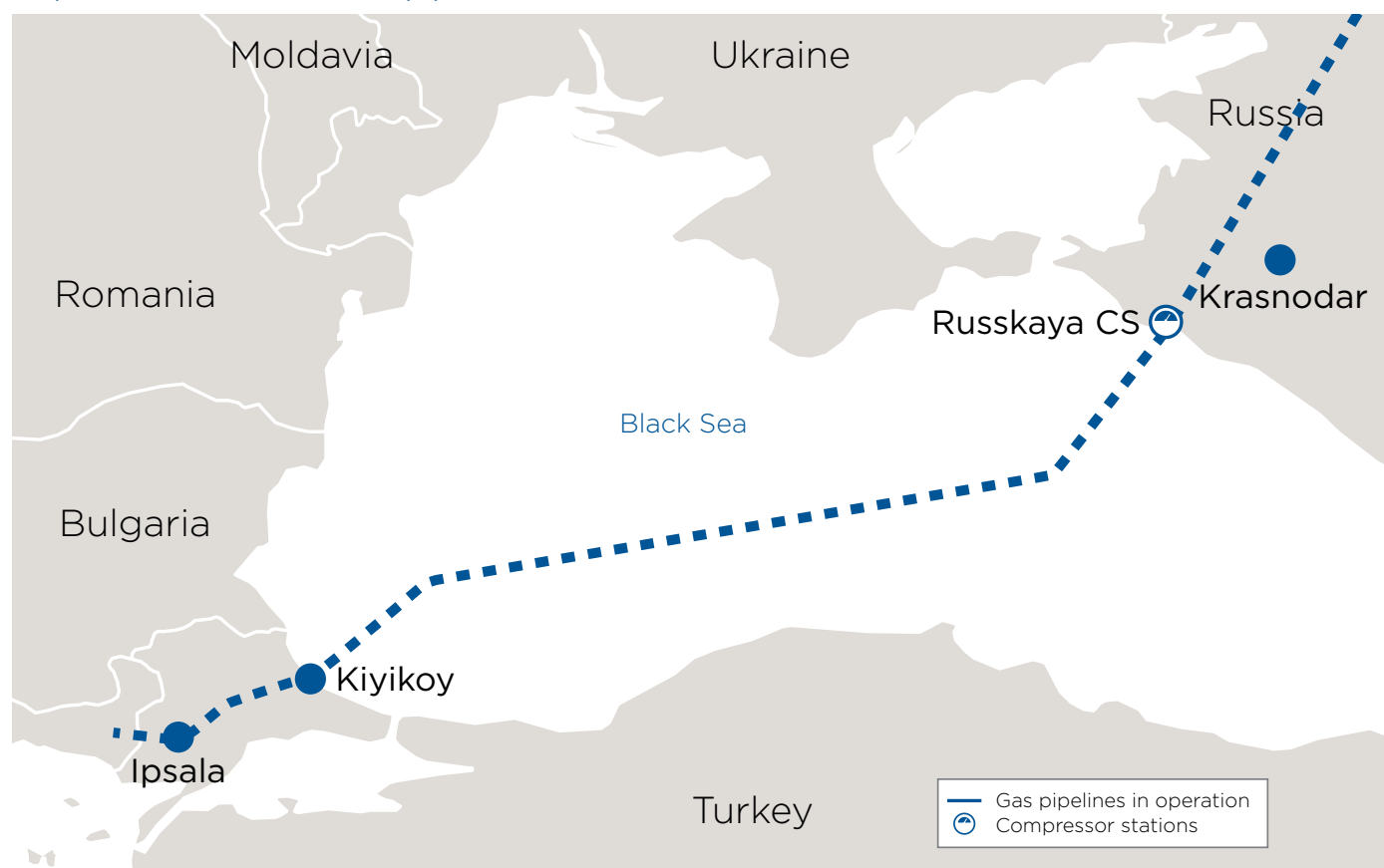
Map 1. Planned Turkstream pipeline route