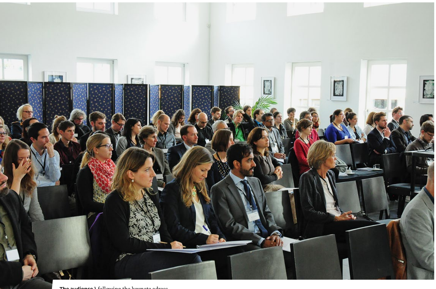
The audience \ following the keynote address

ment that people may occupy over the course of their displacement (IDP to refugee or vice versa); the many vulnerabilities that displaced people experience throughout their journey, including the breakdown of social protection networks; and finally, the ultimate vulnerability of those who are trapped and unable to move. She highlighted how the lack of access to childhood education increasingly appears to be a driver of onward movement from a first country of asylum, particularly since most temporary displacement situations have a way of becoming protracted. She also stressed the need for more attention on displacement-affected communities and what the mass movement of people away from or toward these communities mean for those within them. Another set of characteristics dealt with the perception of displacement—the focus on ‘growing’ statistics of displaced people that need to be analyzed and unpacked; the use of the term ‘crisis’ since the