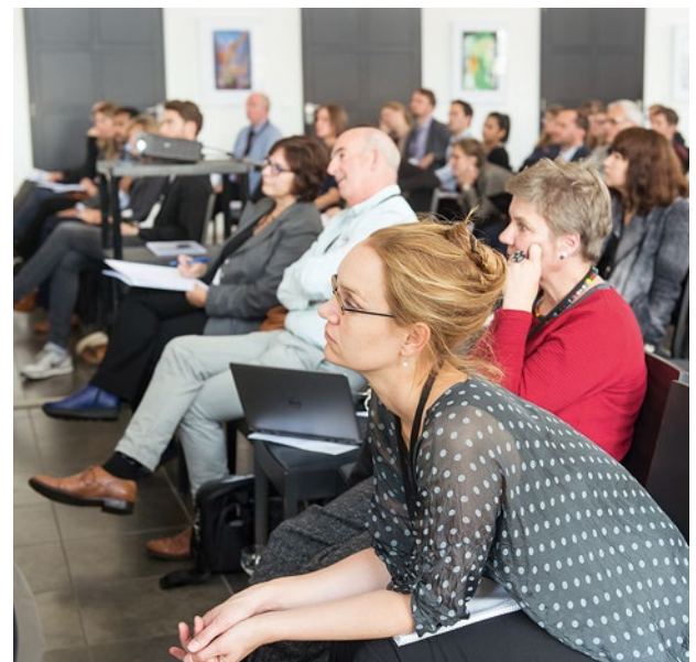
Conference participants \ listening to the opening address