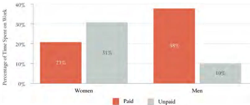
FIGURE 4. DISPROPORTIONATE BURDEN OF UNPAID WORK ON WOMEN