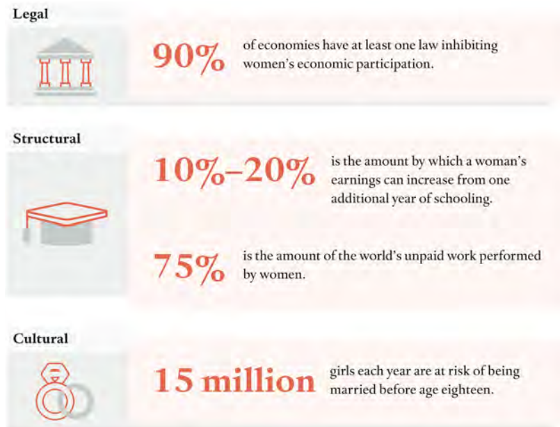
FIGURE 2. LEGAL, STRUCTURAL, AND CULTURAL BARRIERS TO WOMEN'S ECONOMIC PARTICIPATION

Despite strong evidence that women's economic inclusion has significant economic benefits, women in high-, middle-, and low-income countries continue to face a range of legal, structural, and cultural barriers that impede their full participation in the economy and undermine broader economic growth (see figure 2).