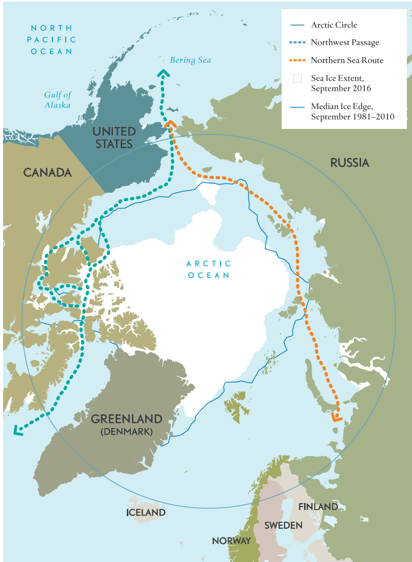
MAP 3: ARCTIC SEA ICE EXTENT AND SEA ROUTES