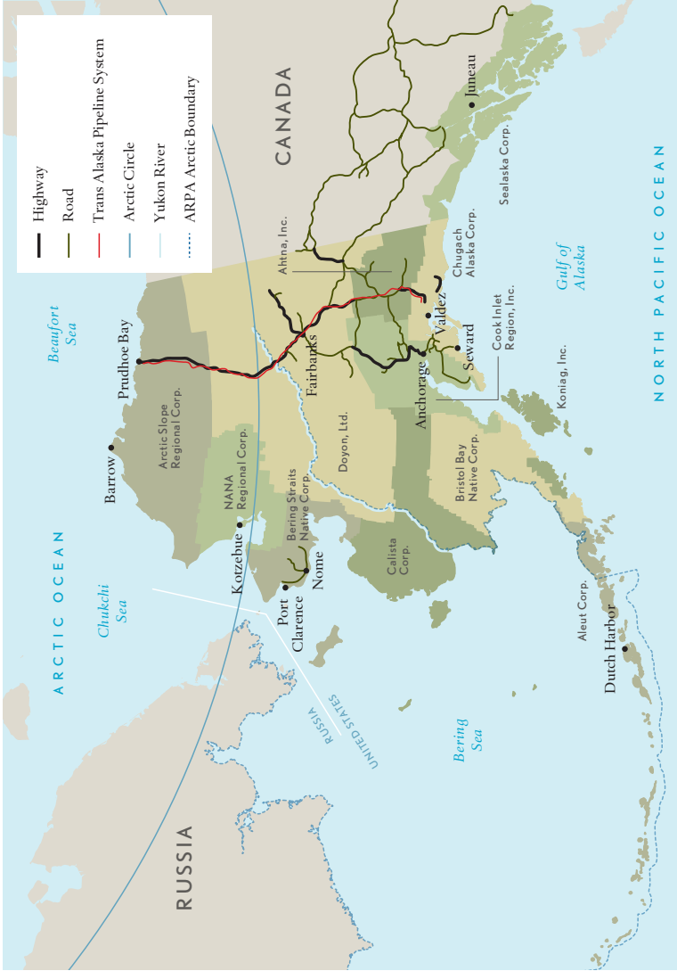
MAP 2: MAP OF ALASKA