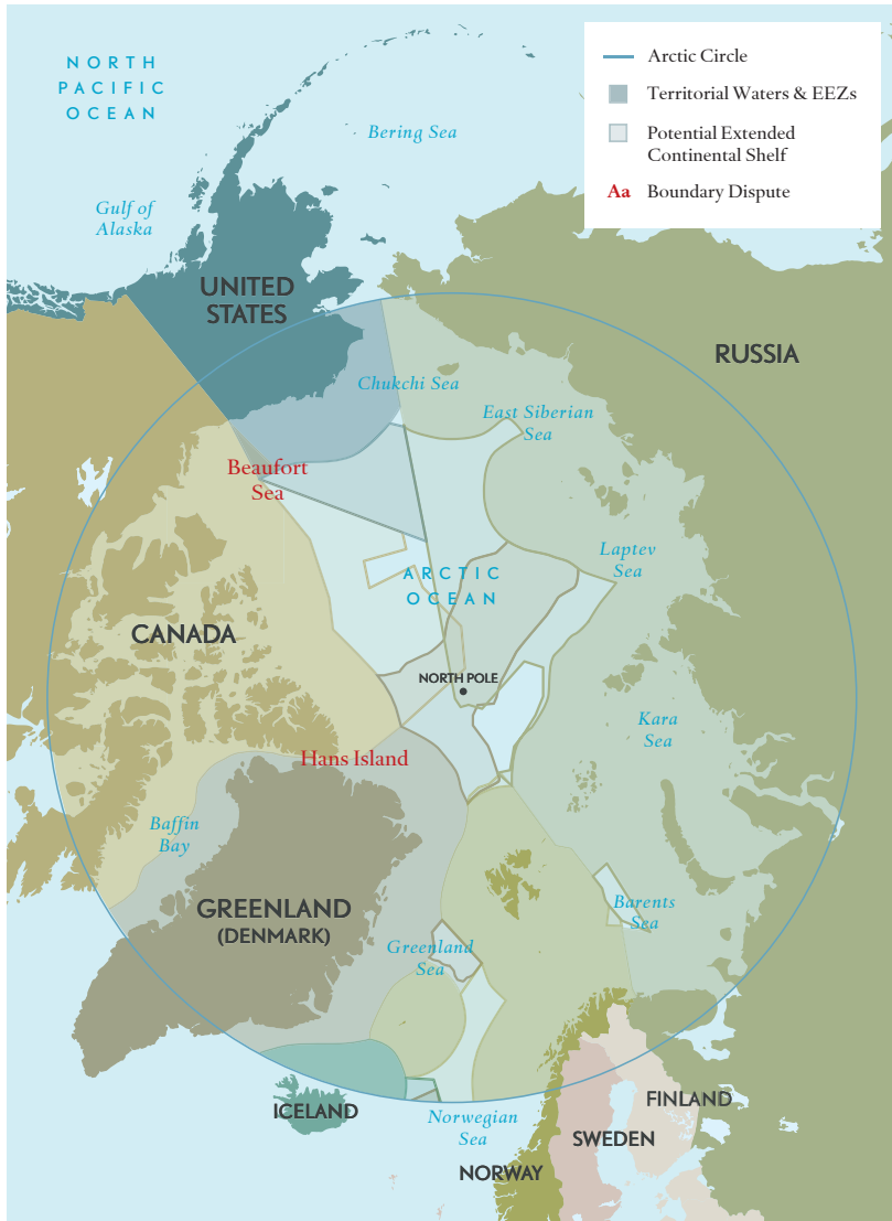
MAP 1: MAP OF THE ARCTIC