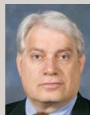
Stephen Blank American Foreign Policy Council