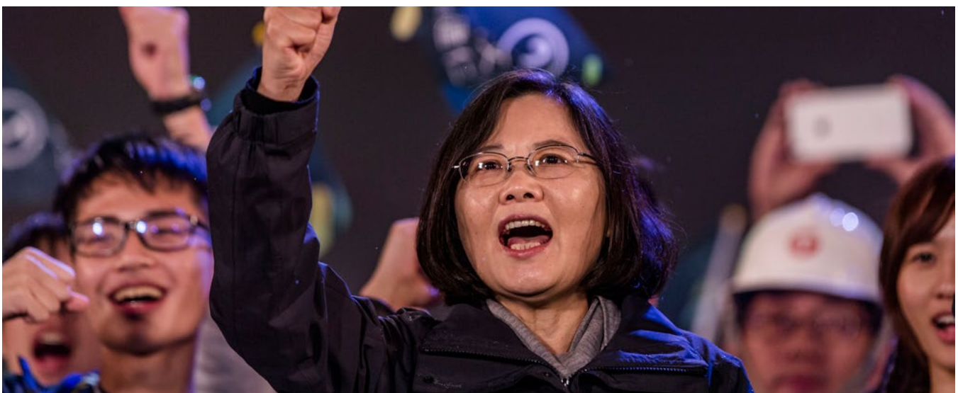
President-Elect Tsai Ing-wen, seen here during a campaign rally, led the Democratic Progressive Party's return to power in Taiwan's 2016 election. Dr. Tsai and her party are taking power just as economic and political headwinds spell trouble for cross-strait relations.

As new American and Taiwanese governments assess their priorities for the coming years, U.S. policy-makers must be aware of the trends at play in Taiwan and their implications for the two countries' strategic and economic relationship. The United States should continue to support Taiwan's defense from conflict or coercion, but that will require a more nuanced approach than occasional boilerplate arms sales. U.S. policy should seek to shift Taiwanese strategic concerns from hardware prestige to human capital prestige, buttress Taiwan's defensive capabilities with smart investments rather than just expensive ones, and — crucially — back Taiwan's efforts to integrate more deeply into the international marketplace. By doing so, Taiwan may be able to improve its deterrence against Chinese threats, get its economy growing again, and achieve greater international visibility than it now enjoys — all without sliding from China-skepticism to China-hostility.