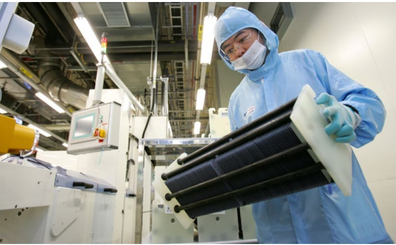
Taiwan's high-tech manufacturing sector has been a traditional source of growth. Here, a Gintech Energy Corporation employee handles solar panels at a Chunan photovoltaic plant.

malaise and fear that it was becoming consumed by its neighbor's overwhelming size. Without a return to growth and a sense of affirmative identity, Taiwan could become focused on an identity built largely in contrast to China — a development that could bring with it a worrying rise in tensions.