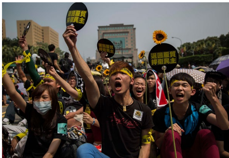
Sunflower Movement demonstrators protest a contentious cross-strait trade agreement in March 2014. The movement came to define the economic anxiety and suspicion associated with President Ma's policy of cross-strait rapprochement.

Ironically, though Taiwan sees TPP as a way to hedge against Chinese influence, if the cross-strait relationship deteriorates many countries may become less willing to endorse Taiwanese accession to TPP for fear that it would be provocative or destabilizing. 20 This is all to say nothing of the substantial economic liberalization that Taiwan would have to pursue domestically, precisely at a time when popular anxiety may be imposing protectionist pressures on its elected leaders. Taiwan's accession to TPP faces several hurdles, but not insurmountable ones. U.S. policymakers will likely play a key role in determining its ultimate feasibility, and should study the geopolitical prerequisites for Taiwanese accession and the strategic implications that could ensue.