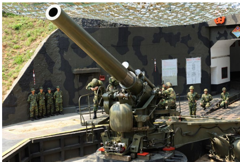
Hardened gunnery embedded in Taiwan's mountainous terrain — inspired by this 1960s-era howitzer — could threaten invading naval assets while withstanding significant aerial bombardment. (Alberto Buzzola)

including formal congressional notification. This will signal to Taipei — and Beijing — that Washington views these efforts at warfighter and institutional capacity building as just as important as periodic arms sales.