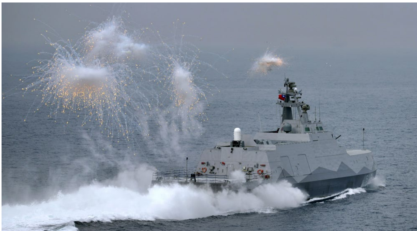
A domestically-constructed Taiwanese missile corvette launches flares during pre-election military drills in January 2016. Taiwan's shipbuilding successes have prompted some to advocate for domestic submarine construction as well.

longtime restrictions on arms exports. Sporting a mature submarine-building environment, the Japanese could be persuaded to someday be the foreign manufacturing partner Taiwan seeks. The United States may need to determine whether it prefers a perennially troubled Taiwanese submarine program, a Japanese construction partnership likely facilitated by the United States, or a direct U.S. partnership.