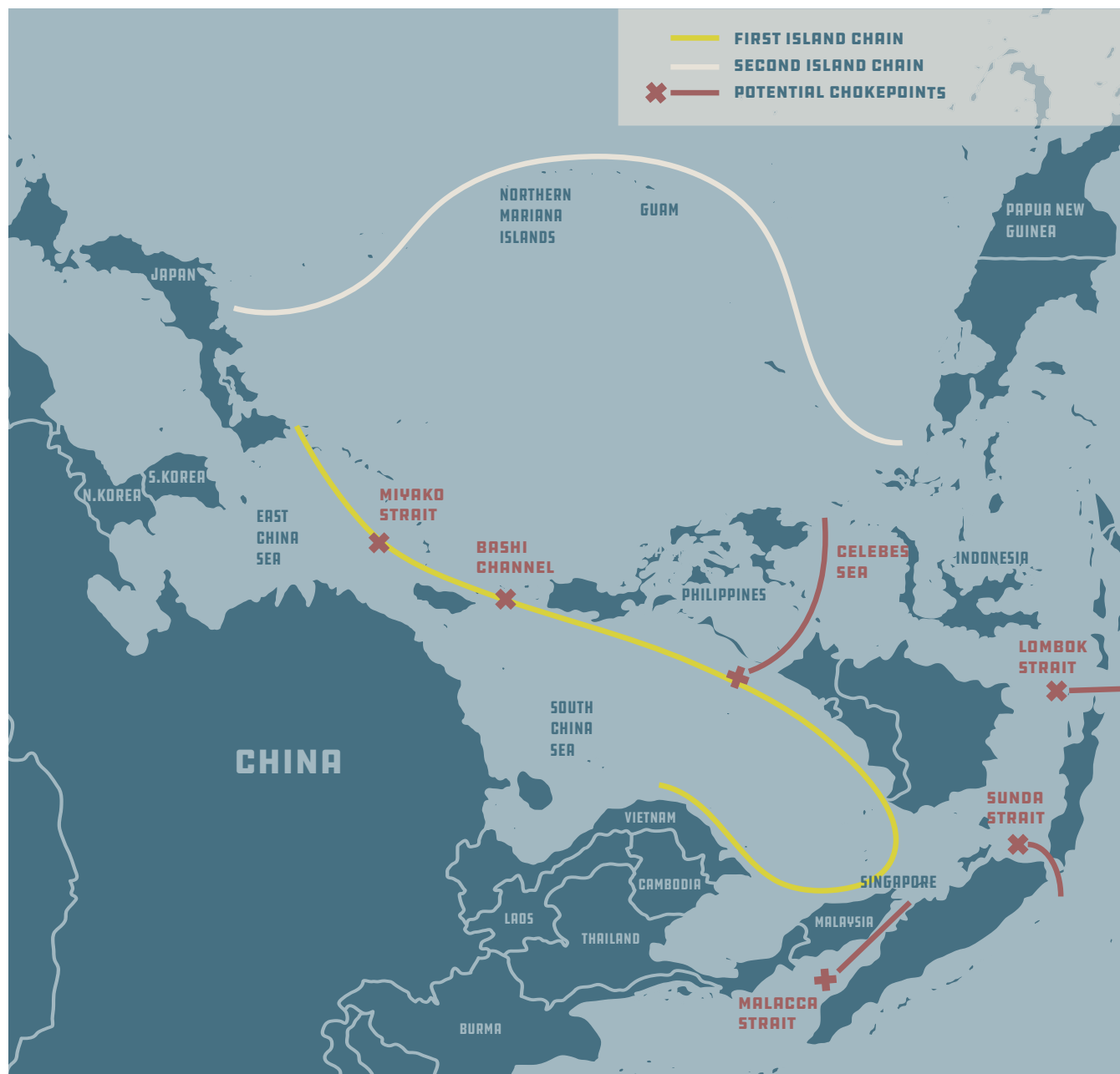
China's two-ocean strategy aims to overcome the challenges presented by natural geographical chokepoints. This map illustrates those chokepoints from China's perspective.