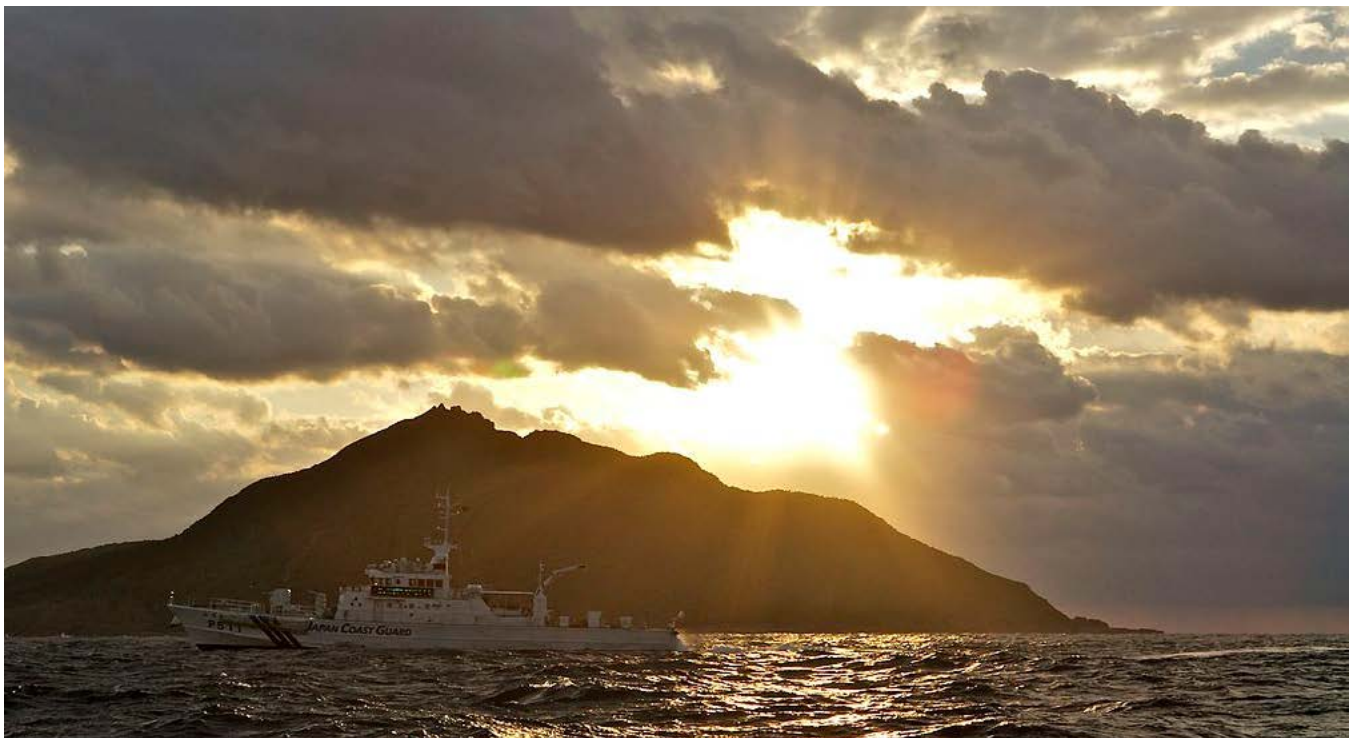
China and Japan both lay claim over the Senkaku/Diaoyu Islands, pictured here. Japan gained clear administrative control over the islands from the United States as part of the Okinawa Reversion Treaty that went into effect in 1972. But the islands have served as a flashpoint for tensions between Japan and China in recent years.

Tensions around the islands simmered but spiked elsewhere in the East China Sea: namely, along the median line where China and Japan both coveted rich gas fields beneath the sea. A few months after Japan announced permission to drill in the Kashi gas field, the People’s Liberation Army Navy (PLAN) dispatched five destroyers to signal China’s protest. In June 2008, Japan and China reached an accord on joint development of natural gas in the East China Sea, a confidence-building measure that has done little to reduce nationalist tensions in either country.