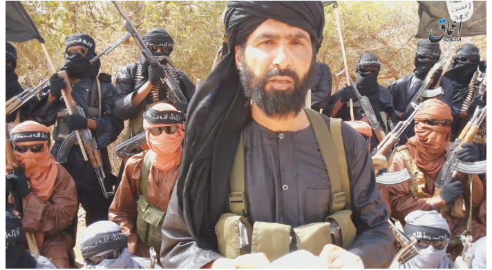
Screen capture from video of Islamic State in the Greater Sahara leader Adnan Abu Walid Sahraoui's bay`a to the Islamic State

Perhaps as a result of its increased international profile since the Tongo Tongo attack, best available estimates (speculative and sometimes wildly fluctuating though they are k ) suggest that as of July 2018, ISGS boasts its largest number of fighters to date. Estimates at the group's emergence in May 2015, based on a video of Sahraoui and his followers pledging allegiance to al-Baghdadi, placed its fighter count at 40. 41 At the date of the Tongo Tongo attack in October 2017, one journalist, citing a senior U.S. counterterrorism official, put its numbers only slightly higher, at 40 to 60. 42 As of April 2018, the U.S. Department of Defense estimated the group