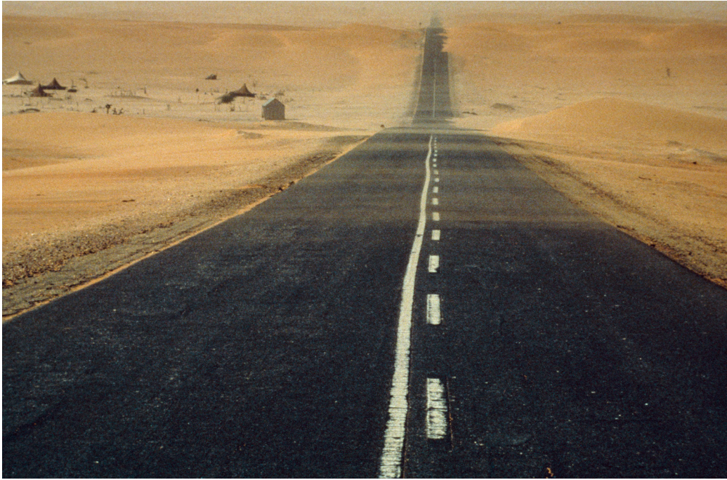
Road connecting Nouakchott to Nema, Sahara desert, Mauritania.

bilities paid dividends. According to the scholar Anouar Boukhars, the government had simply “driven the most hardened militants out of the country and some would-be jihadists have voluntarily left.” 14 In 2009, Mauritania created a rapid reaction force specifically to boost its interdiction capacity. 15 In 2010, Abdelaziz redoubled his efforts and initiated a wide-ranging restructuring of the entire Mauritanian military. 16 A 2014 evaluation of the TSCTP’s effectiveness credited Mauritania’s increased counterterrorism capacity in 2010 and 2011 directly to Abdelaziz’s outreach to allied countries for help. 17 Nouakchott’s ties with Washington reached their zenith in 2013, when Mauritania hosted the 2013 iteration of AFRICOM’s Operation Flintlock. 18