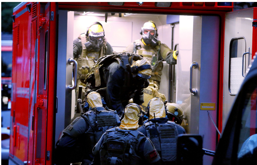
Police officers of a special unit wear protective clothes and respiratory masks during an operation on June 12, 2018, in Cologne's Chorweiler district, western Germany, where police found toxic substances after storming an apartment.

Furthermore, investigators found out that Sief Allah H. had