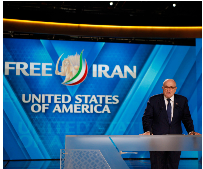
Former Mayor of New York City Rudy Giuliani attends the annual gathering of Free Iran-Alternative 100 ASHRAF at the Villepinte exhibition North of Paris, France, June 30, 2018.