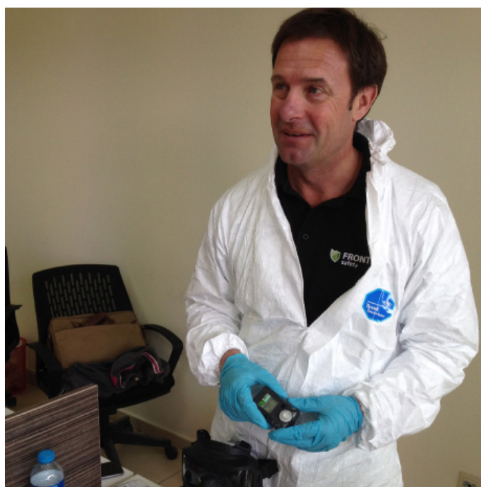
Hamish de Bretton-Gordon in the Turkey-Syria border area analyzing samples after a suspected chlorine attack in Syria

What makes chemical weapons attractive to groups like ISIS is the terrible psychological impact of chemical weapons. I've witnessed how these chemicals have frightened even experienced doctors in Syria and Iraq, deterring them from responding to such