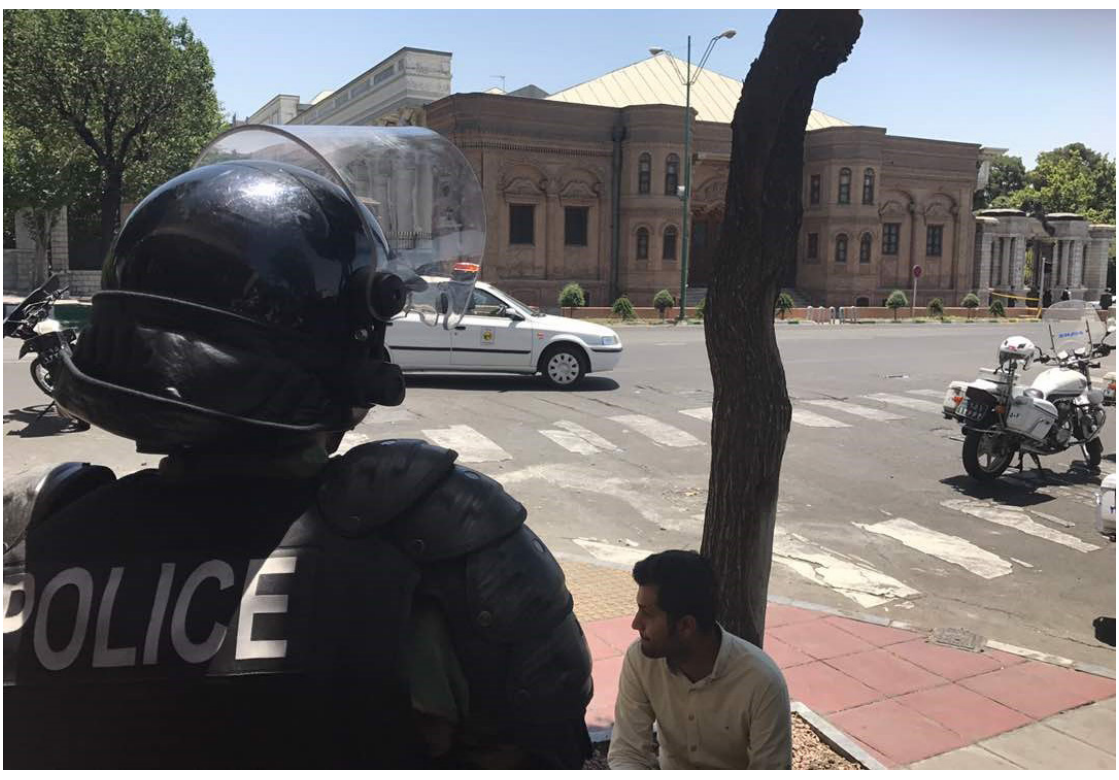
Police take security measures after gunmen open fire at Iran's Parliament on June 7, 2017, in Tehran.

suicide vest while the other was shot and killed by security forces.8