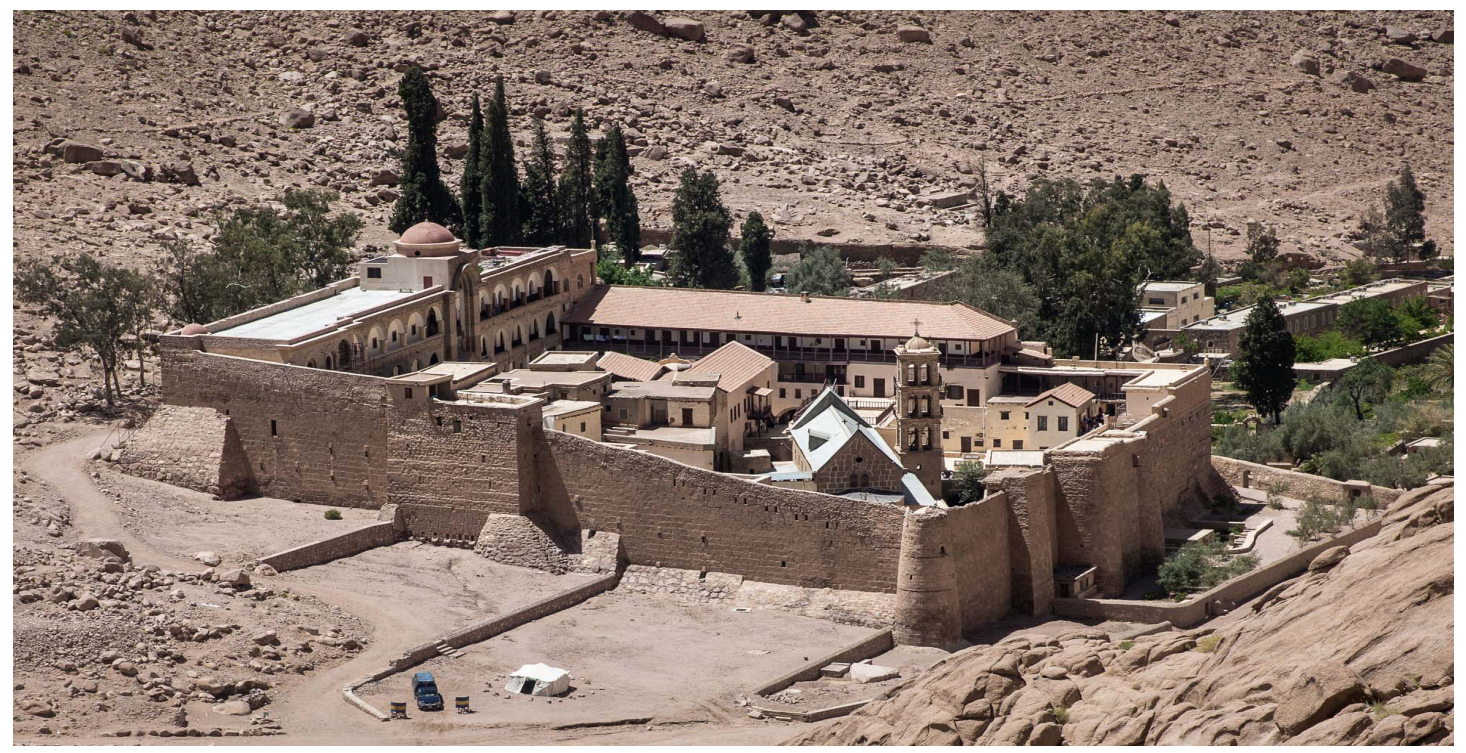
Gunmen opened fire on a guard post near St. Catherine's Monastery in Egypt's south Sinai (pictured) on April 18, 2017, in an attack claimed by the Islamic State.

radical groups in Upper Egypt. Here, many self-styled clerics, mostly those who adhere to salafism, set themselves up as community leaders. Many of these men acted as judges and ran informal courts where they helped settle civil and tribal disputes.<sup>25</sup> Many residents prefer the informal courts to the state courts, which are regarded as corrupt and where it may take years for a judge to rule on a case.