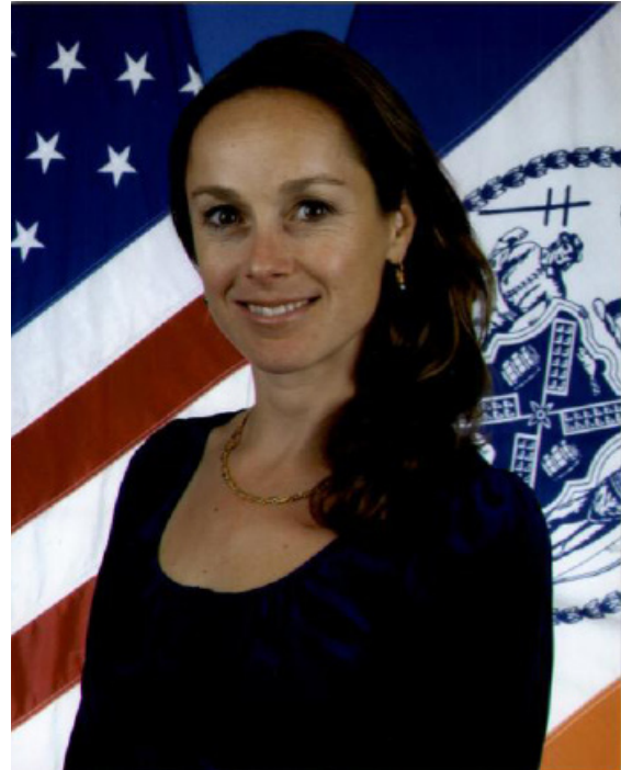
NYPD Assistant Commissioner for Intelligence Analysis Rebecca Weiner

CTC: Notwithstanding the attacks in late 2018 in Strasbourg and Manchester, there seems to have been from late 2017 some reduction in the threat from jihadi terrorism in Europe because of the demise of the Islamic State caliphate, the removal from the battlefield of many of the group's external operations plan-