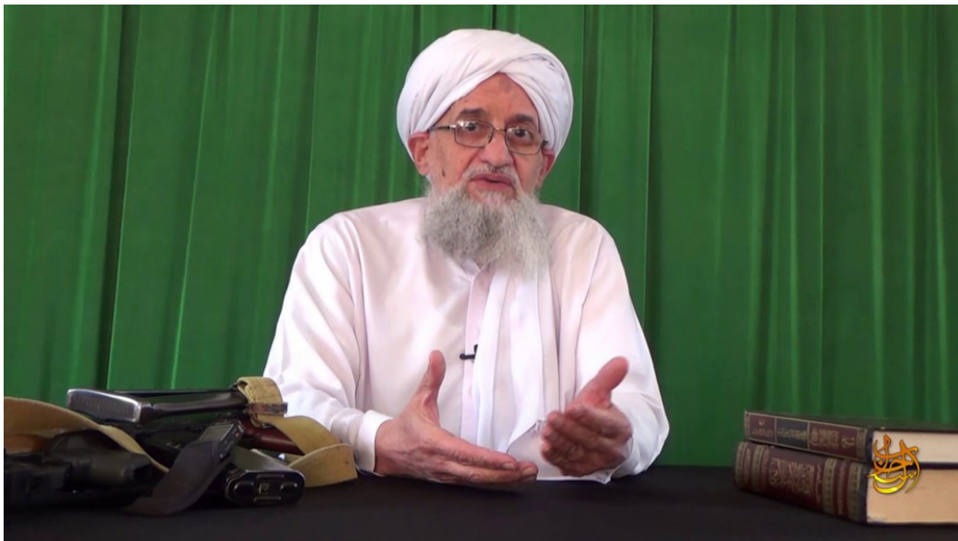
Al-Qa`ida leader Ayman al-Zawahiri (taken from a March 2018 al-Qa`ida media release)