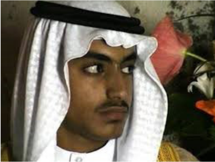
Hamza bin Ladin (taken from video footage released by the Central Intelligence Agency following the 2011 raid on Osama bin Ladin's compound)

calling them “failed experiments” that were representative of the “swamp of the corrupt.” Al-Zawahiri further emphasized that in the “call of jihad,” there is nothing higher than defending sharia law, and emphasized that sharia—what he referred to as al-Qa`ida’s “doctrine of governance”—should never be abandoned. Al-Zawahiri also issued repeated critiques of governments in Muslim-majority countries that al-Qa`ida believed were corrupted by secular law, particularly Egypt, which was mentioned in seven of the 13 statements, and other North African nations such as Tunisia, Libya, Morocco, and Algeria. In January 2018, al-Zawahiri claimed that the “tyrannical regimes” in North Africa had been corrupted and that sharia-based governance was “sacrificed” in these areas in order to please the West.