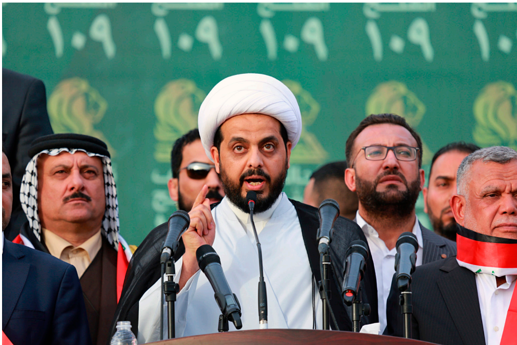
Qais al-Khazali, center, the leader of Asa`ib Ahl al-Haqq, or League of the Righteous, speaks to his followers during a campaign rally in Baghdad, Iraq, on May 7, 2018.

Al-Khazali further noted that personal enmity between him and al-Sadr, driven by what he perceived to be al-Sadr’s jealousy of al-Khazali’s apparently “growing popularity” and “gaining too much power,” contributed to a rift between them. 27 The rift apparently boiled over when al-Khazali arranged for a prominent cleric to deliver a sermon at the al-Kufa Mosque that described an unqualified “calf”—presumably a metaphor for al-Sadr—running a country when a far more capable “bull”—presumably a metaphor for an Ayatollah—remained sidelined. 28 In the wake of this thinly veiled criticism of al-Sadr’s qualifications, al-Khazali feared that al-Sadr was trying to have him assassinated. 29 The divide between al-Sadr and al-Khazali apparently led the latter to take more drastic steps to undermine al-Sadr’s influence both prior to and during al-Khazali’s incarceration. Al-Khazali told the coalition that before being captured, he had begun to form a committee to “end the dictatorship” of al-Sadr. 30 While in prison, he offered to “form a committee inside the prison to teach prisoners against MAS [Muqtada al-Sadr].” 31 Al-Khazali said he would speak with his fellow prisoners about how they remained imprisoned because of the “mistakes that Muqtada al-Sadr has made.” 32