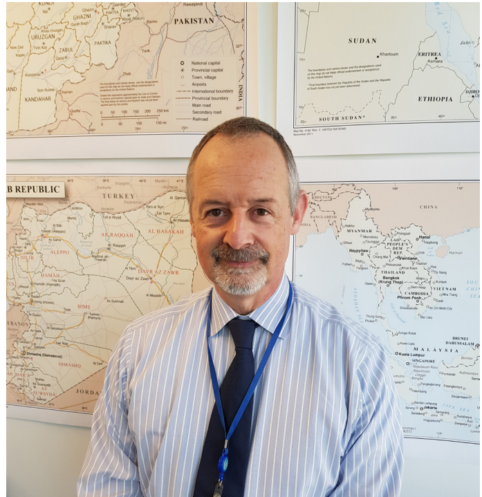
Edmund Fitton-Brown, Coordinator of the ISIL (Daesh)/ Al-Qaida/Taliban Monitoring Team at the United Nations

Fitton-Brown: It's really hard to estimate. We deliberately cited an example in our 23rd report from the Western Balkans because we thought it was quite instructive. You had approximately 1,000 who traveled to the conflict zone in Syria and Iraq and 100 reported killed, 300 returned and that was interesting because that suggested 600 unaccounted for. But of course, that doesn't mean that those 600 out of the original 1,000 are all still alive. 5