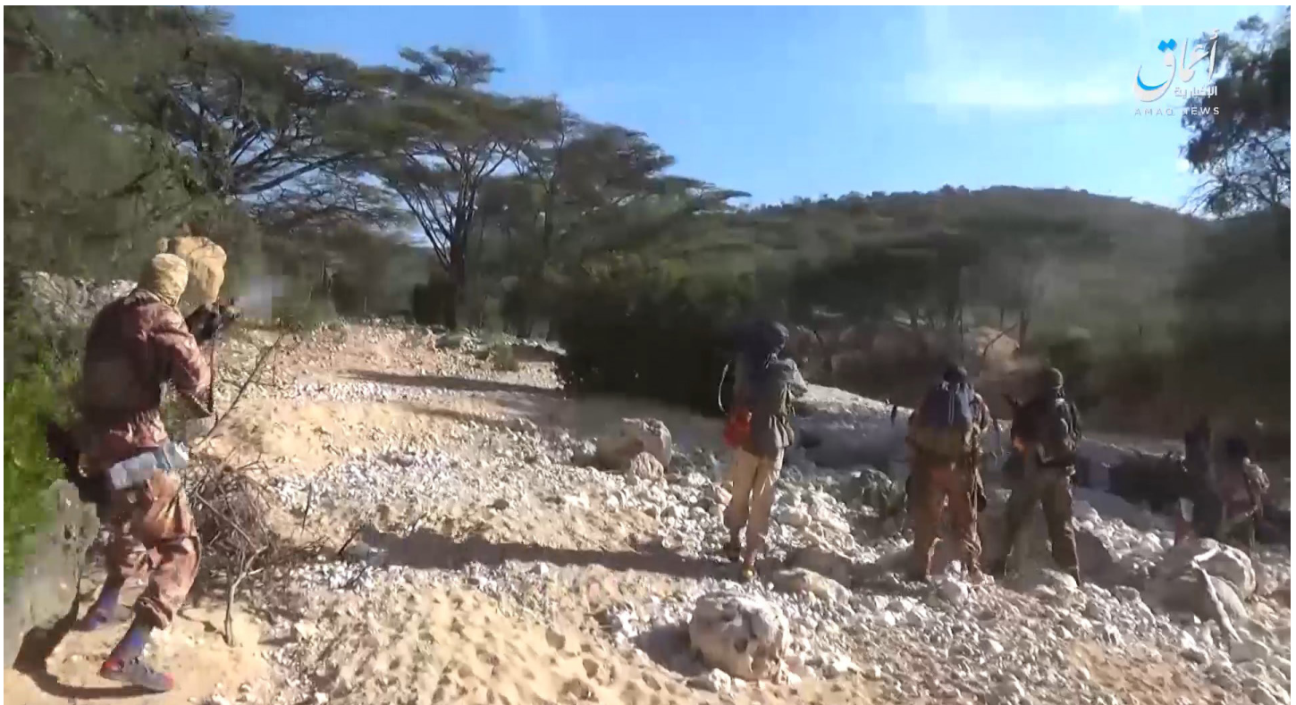
Members of Islamic State in Somalia clash with al-Shabaab fighters in the northern Puntland region in December 2018. (Amaq video, released in December 2018).