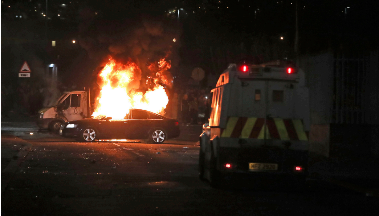
A burning car on April 18, 2019, in Creggan, Londonderry, Northern Ireland, after gasoline bombs were thrown at police.

Omagh a year later. 10 Despite the signing of the Belfast/Good Friday Agreement in 1998, which brought an end to major hostilities between the mainstream loyalist and republican factions, both the Continuity IRA and Real IRA continued to reject the peace process and remain unbowed in their objective of ending British rule in Ireland by violent means. 11