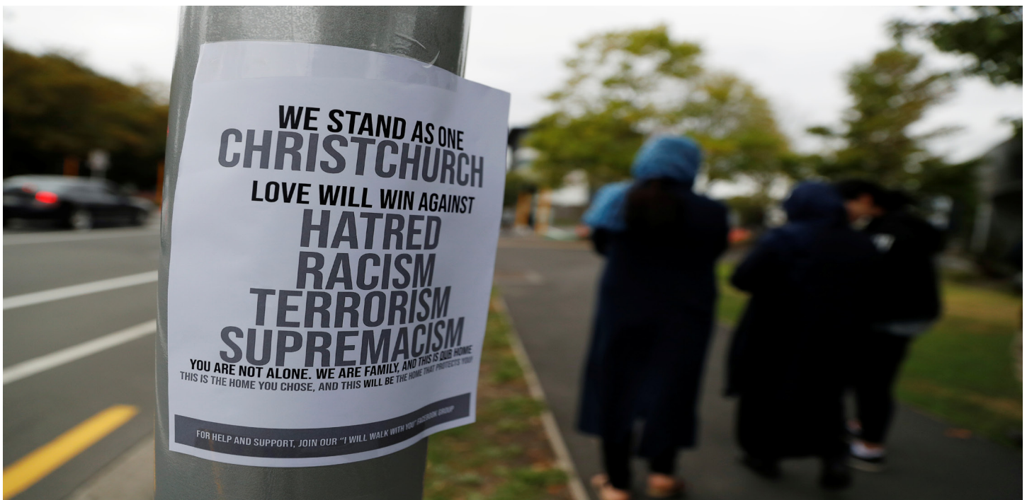
A sign is seen on March 16, 2019, after the mosque attacks outside a community center near Masjid Al Noor in Christchurch, New Zealand.