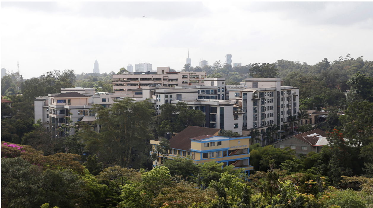
The Dusit D2 hotel complex is seen on January 16, 2019, after security forces had killed all four militants who stormed the upscale hotel in Nairobi, Kenya.

Al-Qa`ida first made its debut in East Africa in 1992, when Usama bin Ladin and his entourage settled in Sudan. 8 With the support of his Sudanese hosts, notably the ideologue Hassan al-Turabi, bin Ladin set to work amassing resources, building a network of alliances, and training a new generation of jihadis. At the time, AQEA was indistinguishable from al-Qa`ida Core. Operations in the region were led and orchestrated by Egyptian members of bin Ladin's inner circle, including his deputy, Abu Ubaidah Al-Banshiri; al-Qa-