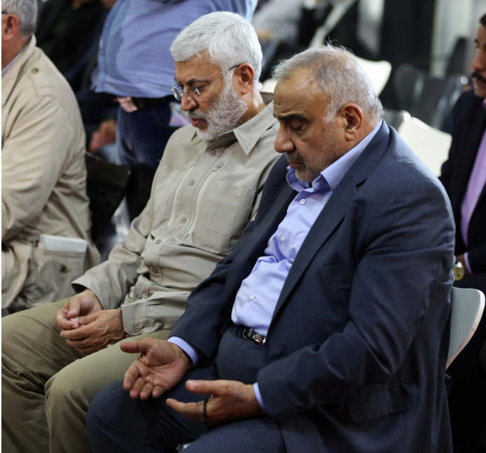
Abu Mahdi al-Muhandis, left, a commander in the Popular Mobilization Forces, and Adil Abd Al-Mahdi, right, then Minister of Oil and now Prime Minister of Iraq, attend the funeral of Iraqi politician Ahmad Chalabi, in Baghdad, Iraq, on November 3, 2015.

PMF Basra Operations Command, both led by Badr commanders. 98 These commands appear to be maintained by Badr in readiness for any of a number of contingencies: the deployment of Badr PMF units to restore order during electricity-related or secessionist rioting, to deliver civil engineering and disaster relief, or to crack down on uncontrolled militias. t