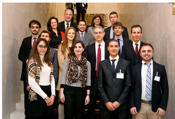
Conference speakers and New-Med team

Entitled “Youth and the Mediterranean: Exploring New Approaches to Dialogue and Cooperation,” the conference was organized in the framework of the ongoing New-Med Research Network, a project run by IAI in cooperation with the Italian Ministry of Foreign Affairs and International Cooperation (MAECI), the OSCE Secretariat in Vienna, the German Marshall Fund of the United States (GMF) and the Compagnia di San Paolo of Turin. 2 Launched in June 2014, New-Med is a network of Mediterranean experts and policy analysts aimed at fostering scholarly reflection on changing developments in and around the Mediterranean, providing key inputs to the political debates taking place in policy fora, including in the context of the OSCE Mediterranean partnership. Since its inception, the New-Med Research Network has organized fifteen international conferences and published 31 policy papers, reports and edited volumes on various themes tied to Euro-Mediterranean relations. 3 Most recently, New-Med organized an international conference at the offices of the Representation of the European Commission in Athens, Greece, on 16 December 2016 to examine various dimensions of the ongoing migrant and refugee crisis in the Mediterranean. 4