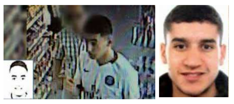
Hussain and Younes Abouyaaqoub- Barcelona Attacks