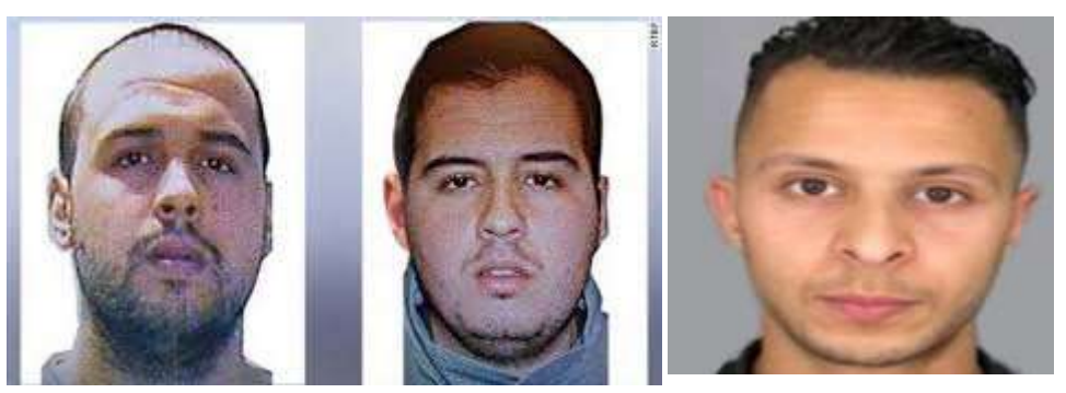
Khalid and Ibrahim Bakraoui, Saleh Abdeslam- Paris/Brussels attack