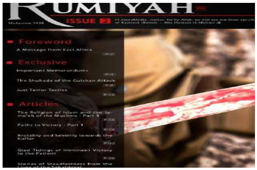
The cover of the second issue of ISIS's Rumaiyah magazine.