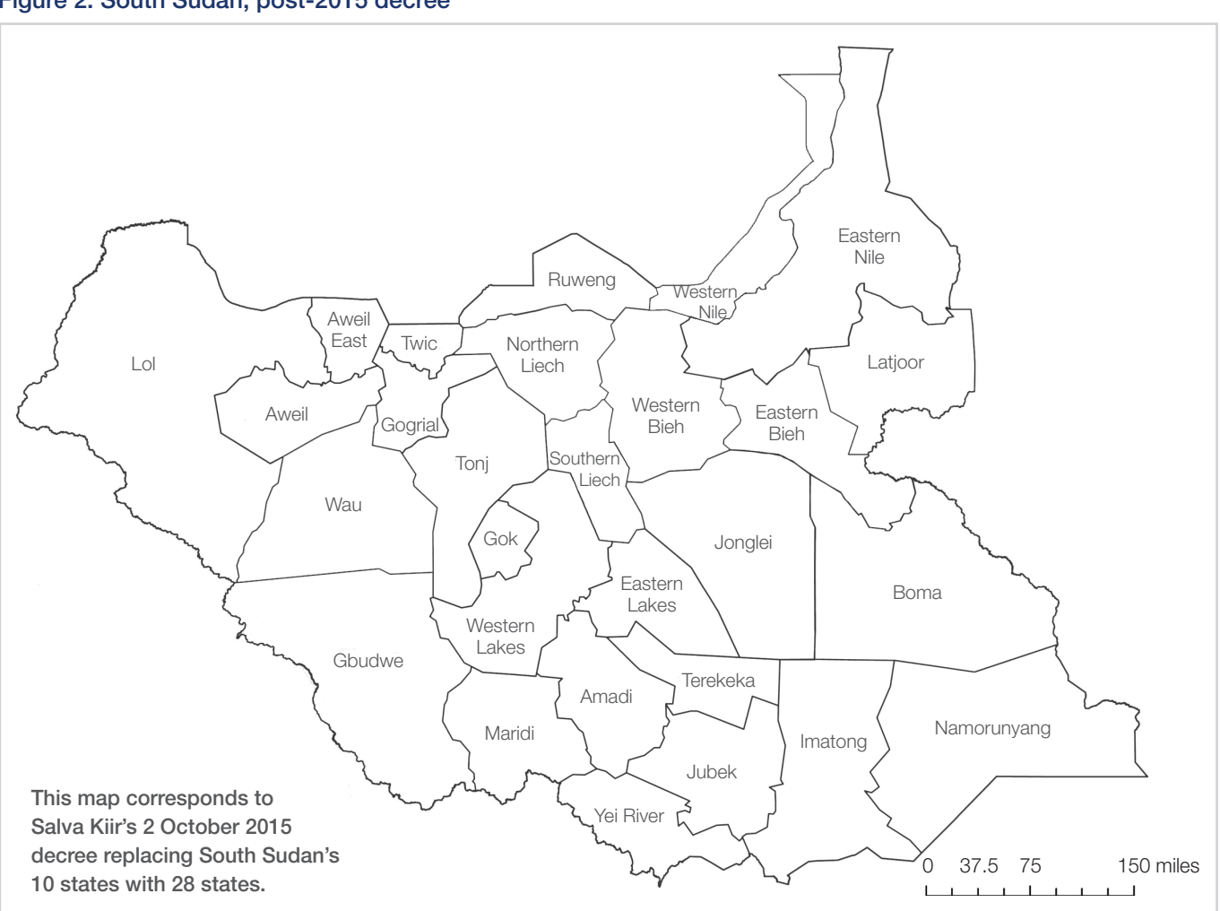
Figure 2: South Sudan, post-2015 decree

Other flashpoints are emerging in Jonglei, with land taken from the Nuer in Upper Nile, and in Western Bahr El Ghazal, with the annexation of Rajah to Aweil West and North. In Equatoria, conflicts are also starting to emerge, for example the struggle over borders between the Bari and the Mundari in Mongalla.