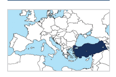
TURKEY'S GEOGRAPHIC LOCATION WILL ALWAYS MAKE IT PIVOTAL TO THE STABILITY OF STATES IN THE REGION AND OF EUROPE

Realistically, the breathing space the EU-Turkey agreement provided is running out. Erdogan has indicated his impatience with the EU's failure to complete what he perceives to be its side of the bargain, and has threatened on a number of occasions to terminate it.<sup>80</sup> The authoritarian response of the government to the July coup attempt, including the possible reinstatement of the death penalty, has increasingly polarised EU member states and Turkey.<sup>81</sup> The EU has shown little evidence that it has alternative strategies in place once the deal crumbles, and Turkish surveillance of coastal routes is relaxed. The reopening of the floodgates along the Aegean route seems inevitable.