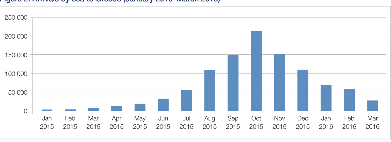
Figure 2: Arrivals by sea to Greece (January 2015-March 2016)

This was not a new route. In December 2003, in one of the earlier documented disasters on this route. news agencies reported that an estimated 60 people had drowned in the Aegean after a boat carrying migrants from Iraq, Afghanistan and Jordan sank in mild weather. 19 But the route had never before been used at the scale seen in 2015–16. A number of reasons have been attributed to its sudden prominence: Syrians started moving to Greece in large numbers in 2014, mindful that their chances of returning home any time soon were fading; the movement quickly generated its own momentum and was being advertised widely on messaging platforms such as WhatsApp and social media such as Facebook, as well as in mainstream media, which had easier access than they did to other migratory routes at sea; the relative ease of operating in Turkey at the time attracted a proliferation of small