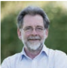
Course Convenor: Professor Hugh White

Asia is in the throes of a major power-political revolution, as a radical change in the distribution of wealth and power overtakes the old order and forces the creation of a new one. Explore three areas of the new power politics of Asia: the nature of power politics as a mode of international relations; the power politics of Asia today, what is happening and where it is going; and concepts that can help us better understand power politics.