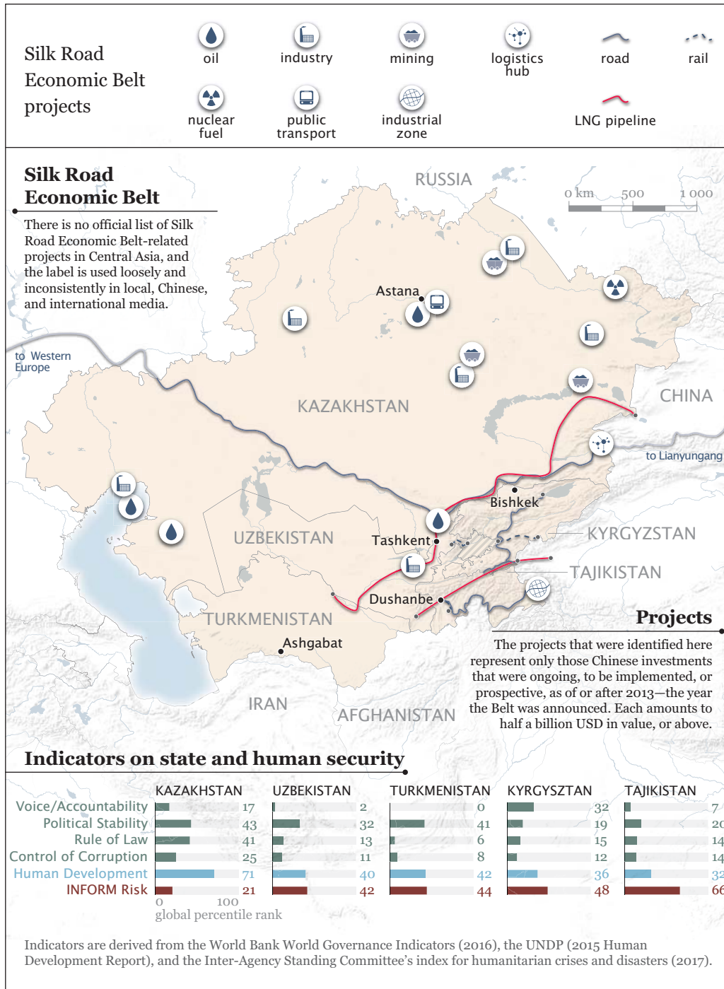
Figure 2.1. Map of Central Asia illustrating Silk Road Economic Belt projects and fragility indicators per state