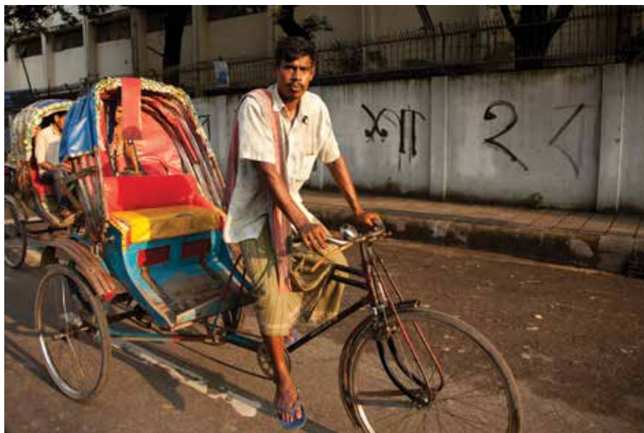
A rickshaw driver in Dhaka.

order to hold job fairs. In Sunamganj, participants reported several cases of land being seized from indigenous groups by local politicians or politically connected mastaans . The case of Gaibamdha sugar mill meanwhile was also cited as an example of political complicity in the disenfranchisement of indigenous groups in Bangladesh. 38