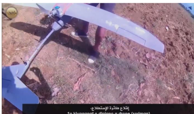
Figure 4: Drone launch by Filipino jihadists

The content of IS-influenced indigenous propaganda also provides clues to novel techniques and tactics that were imparted to Filipino militants from overseas. IS in Syria and Iraq demonstrated that it is possible to use consumer-grade quadcopter drones to deliver lethal payloads.[37] In the Philippines, MG members documented a test flight of their surveillance drone (Figure 4).[38] The device in question is a simple glider-type drone which is less sophisticated than the quadcopters used by IS to drop grenades. It is currently unknown if the MG were able to progress from rudimentary surveillance drones to the quadcopter bombers of IS in Iraq/Syria.[39]