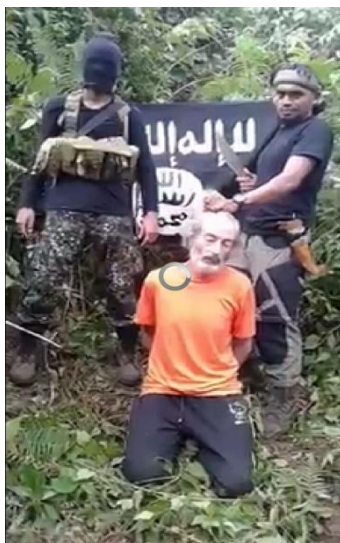
Figure 3: Execution of Robert Hall

Only a crude reproduction of an IS flag could be seen in the Ridsdel and Hall videos. These proof-of-life/KFR videos were not as widely disseminated on Telegram channels frequented by IS sympathisers. The lack of IS branding has limited the reach of such propaganda, demonstrating the utility of Amaq-style aesthetics.