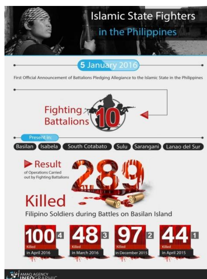
Figure 5: Amaq Agency infographic on alleged Philippine military casualties

As early as April 2016, Hapilon’s faction, together with foreign nationals, launched what some observers claimed as being the first IS attack on Philippine soil.[44] ASG fighters along with foreign fighters ambushed troops from the 55 th Infantry Battalion. Killed were 18 soldiers and 26 militants, including the Moroccan bomb maker Mohammad Khattab. Amaq propagandists claimed 100 soldiers were killed in Basilan during the 9th of April attack (Figure 5).[45]