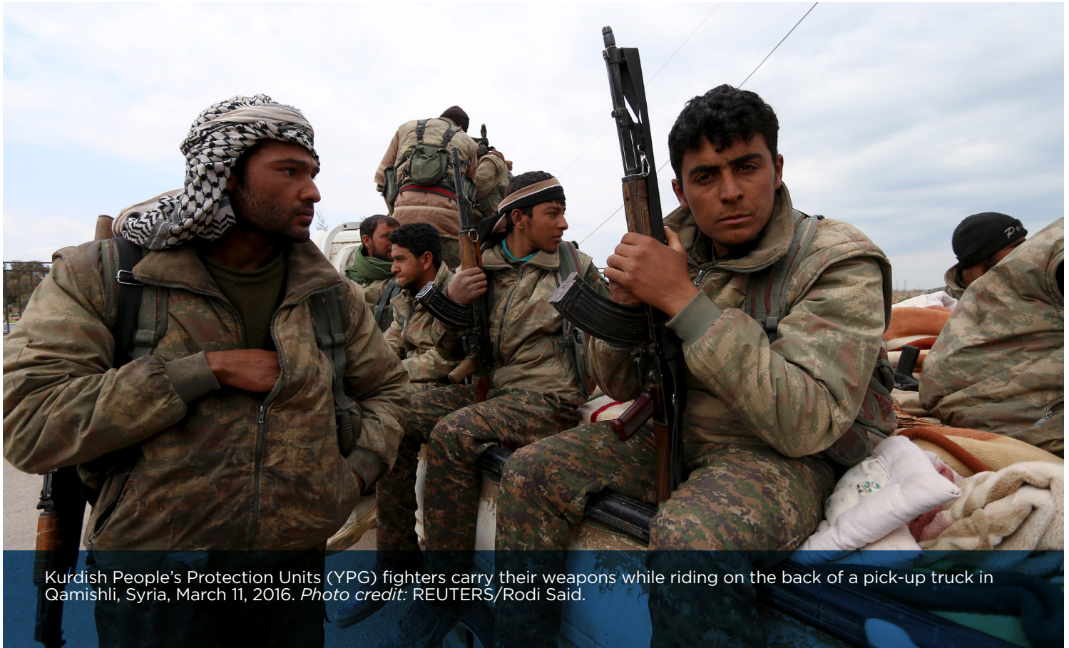
Kurdish People's Protection Units (YPG) fighters carry their weapons while riding on the back of a pick-up truck in Qamishli, Syria, March 11, 2016.

the jihadist groups—two goals Turkey shares with the United States.