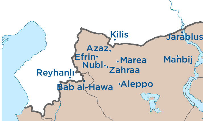
Map 1.A Key Locations in Northwestern Syria