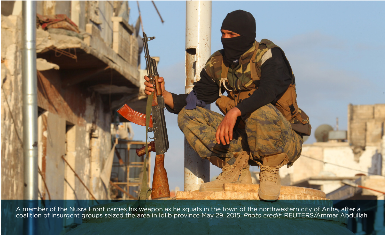
A member of the Nusra Front carries his weapon as he squats in the town of the northwestern city of Ariha, after a coalition of insurgent groups seized the area in Idlib province May 29, 2015.

made it tolerate foreign fighter flows across the Syrian border from 2011 to 2014. This provided extremist groups with recruits and freedom of movement, and allowed cross-border networks to emerge that helped to sustain these groups economically. 17 One unintended result is that the Nusra Front became a powerful entity in and beyond northern Syria. ISIS eventually captured entire provinces in Syria and two major urban population zones, along with substantial oil reserves and infrastructure, emerging as one of the strongest and most well-resourced fighting groups.