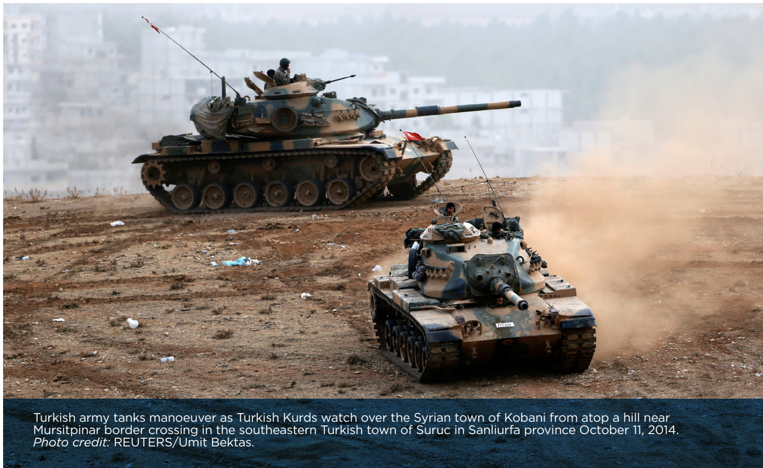
Turkish army tanks manoeuvre as Turkish Kurds watch over the Syrian town of Kobani from atop a hill near Mursitpınar border crossing in the southeastern Turkish town of Suruc in Sanliurfa province October 11, 2014.

feared the Syrian regime's collapse would drive thousands of refugees to Turkey and allow the PYD to take advantage of the chaos to declare an independent Kurdish state in northern Syria. 3 The PYD is the Syrian branch of the Kurdistan Workers' Party (PKK), a US-, EU-, and Turkish-designated terrorist group that has waged an insurgency in Turkey for three decades.